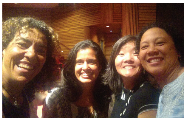
Participants at the PGM ONE Summit, Berkeley, CA, 2019.

There are many more angles that could be included to help connect more dots. For instance, while exposure, experience, and experiential learning in