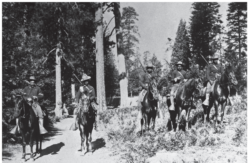
Buffalo Soldiers in the 24th Infantry carried out mounted patrol duties in Yosemite National Park, 1899.

On the federal government level, we acknowledge the history of segregation on public lands and conflicts that sometimes arose among, and between, users and land managers as a result of