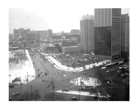
Recent conditions at the site of Campus Martius, a historic square in downtown Detroit that may soon be revived

Some of America's longest-lived public spaces—Santa Fe's Plaza and the greens and commons of so many New England towns-have survived for centuries because they have been able to adapt to the changing times, playing different roles as circumstances change. Their designs are so simple that they can function as blank tablets upon which towns or cities can inscribe their cultural and civic legacy. That is the model new civic squares should emulate: be flexible enough to respond to the various possibilities that exist now and mutable enough to evolve as urban society does over time. That's how a square becomes a place that people return to, day after day, year after year, a place that is so embedded in a city's regular rhythms that no one can remember what it was like before the return of the civic square.