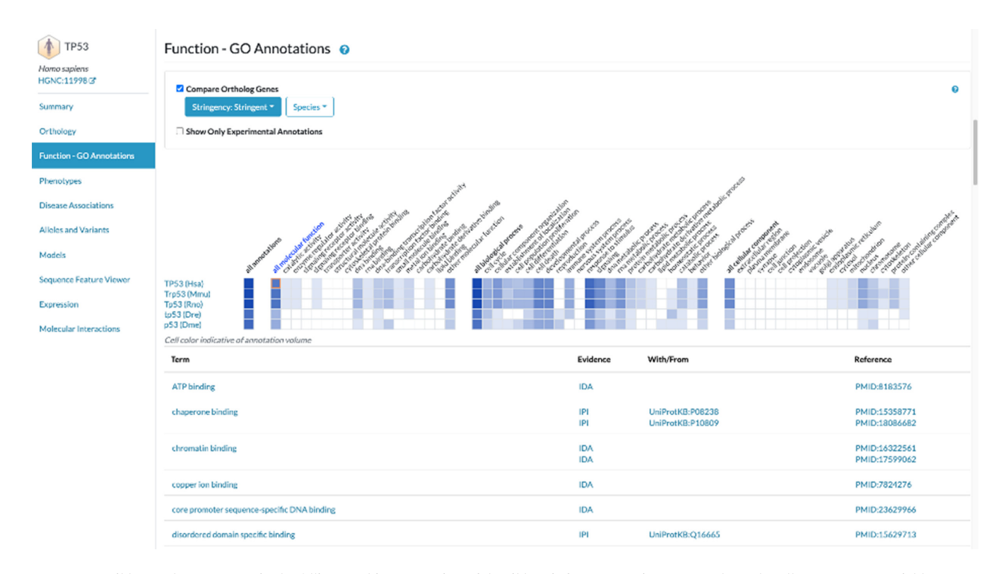
Figure 4. GO ribbon web component in the Alliance. This new version of the ribbon is fast, easy to integrate and now handles gene sets to quickly compare the function of several genes. In this example, the ribbon is used to highlight the differences between orthologs of TP53. Clicking on a high-level function (GO term) such as 'cell death' will open a table detailing all the annotations related to 'cell death', while clicking on 'all molecular function' will show all the available molecular function annotations for those genes.