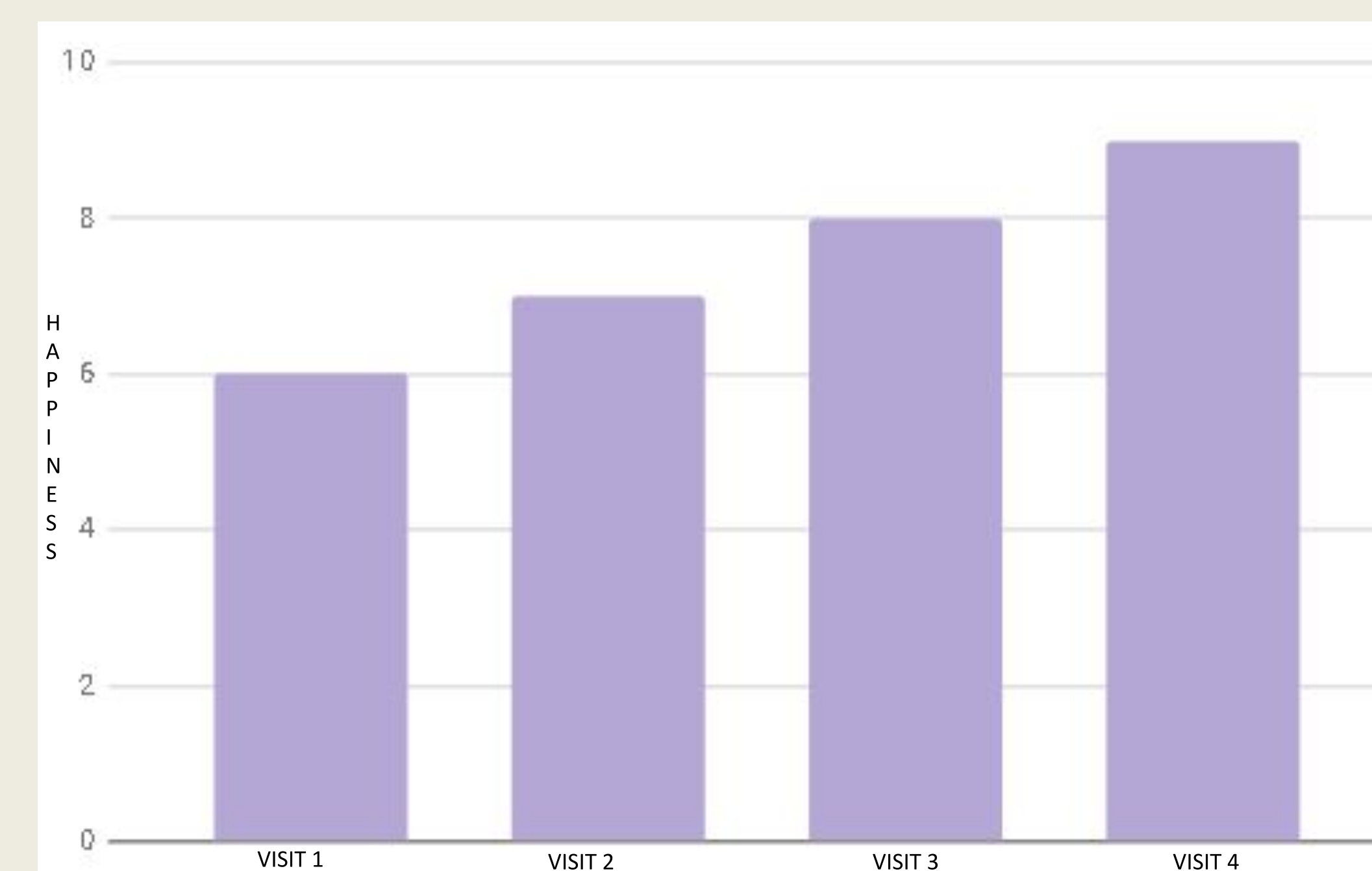
Figure 2: Effect of Mindfulness Intervention on Happiness