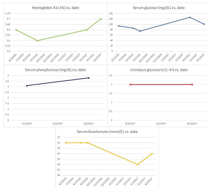
Figure 1 - Graph of RUA measurement of glycosuria as measured on routine urinalysis vs. date, serum glucose levels in mg/dL vs. date, serum Hco3 mmol/L vs. date, serum phosphorous mg/dL vs. date, and hemoglobin a1c (%) vs. date.

Table 1 lists medication induced, genetic, and acquired causes of proximal convoluted tubular dysfunction.