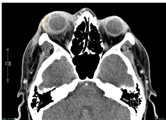
Image 2. Rim-enhancing fluid collection (arrowheads) lateral to the right globe consistent with orbital abscess.

proptosis and ophthalmoplegia. In these indeterminate cases, a point-of-care ultrasound showing only superficial eyelid edema would potentially increase the confidence in the