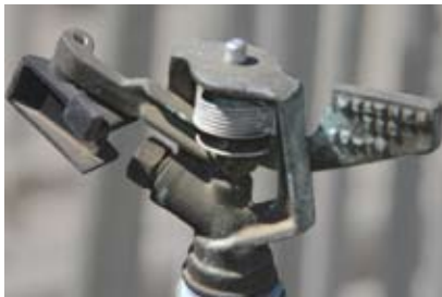
Figure 2. Sprinkler nozzle. The size is stamped on the hexagonal surface of the nozzle.

Note: Metric conversion: 1 in = 2.54 cm.