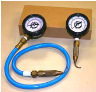
Figure 3. Pressure gauge fitted with a pitot tube to measure sprinkler nozzle pressure.

Third, the slope of the land also affects the soil intake rate, since water runs off faster from an orchard with a slope than it does from a level orchard.