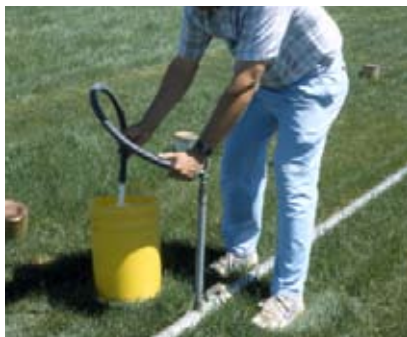
Figure 5. Determining the sprinkler discharge rate by collecting a measured discharge for a recorded period of time.