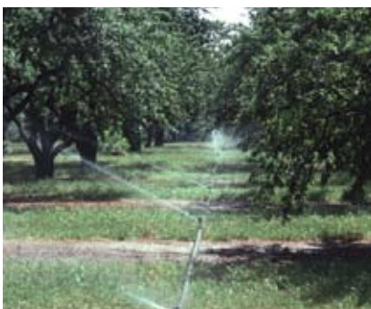
Figure 6. Temporary hand-move orchard sprinklers.

the water into the bucket and timing how long it takes to fill the bucket, the discharge rate from the sprinkler can be determined by the following formula.