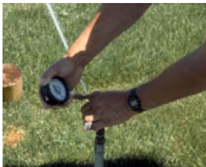
Figure 4. Determining the sprinkler operating pressure using a pitot tube and pressure gauge.