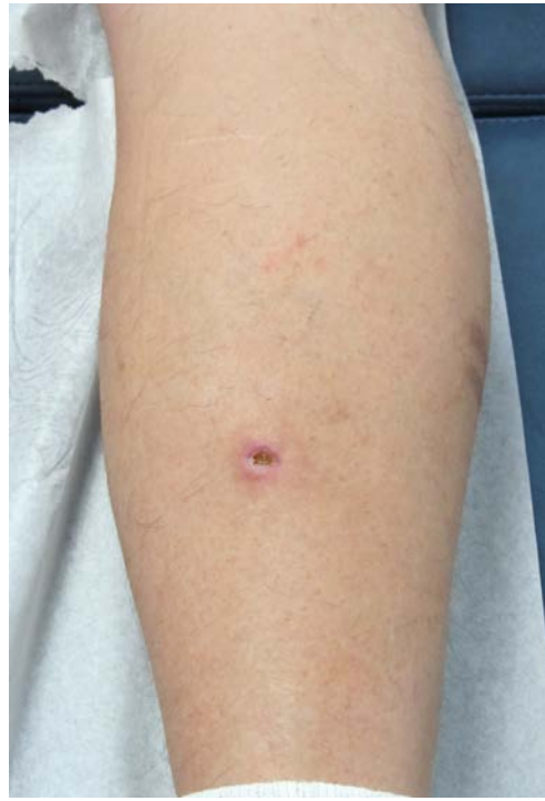
Figure 2. Ulcerated nodule at site of the stingray tail wound present 2 months after the initial injury.

Physical Examination: Two months after the injury, the patient presented with a firm, erythematous, 1 cm nodule with a central puncture site. The nodule was surrounded by a slightly violaceous subcutaneous plaque, approximately 4 cm overall, on the posterior aspect of the lower leg (Figure 2). Incisional biopsies for both tissue culture and histopathologic analysis were obtained.