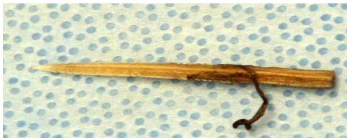
Figure 1. Stingray tailpiece removed from patient's lower leg.

History: A 63-year-old man sustained a penetrating wound from the tail of a stingray while fishing in San Francisco bay, California. A portion of the barbed tail (Figure 1) was embedded into the man's posterior lower leg penetrating through the musculature to the periosteum of the tibia. The tail piece was removed in the emergency room and he was treated with a 10 day course of trimethoprim/sulfamethoxazole. Over the next two months he developed a non-fluctuant, subcutaneous mass at the site of the injury. The puncture site continued to drain a clear serous fluid that did not grow any pathogenic organisms (alpha-hemolytic Streptococcus sp. only).