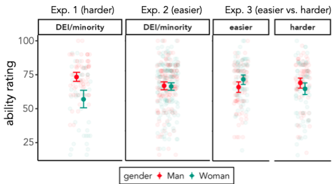
Figure 3: Gender and task difficulty impacted ability ratings in the DEI/minority condition.

Exps. 1 and 2. Half of the participants were in the harder condition (as in Exp. 1; N = 151 ; 75 women), and half were in the easier condition (as in Exp. 2; N = 151 ; 76 women).