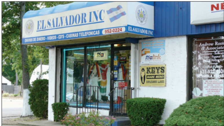
Figure 3: One of many new Salvadoran-owned businesses in Brentwood