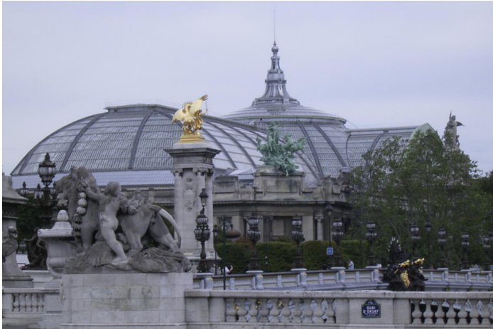
Figure 1. The Grand Palais built in 1900. Editors’ note: In the printed version of this journal, the figures are in black and white.

Palais is a central symbol of power, pride and importance: “un site emblématique du patrimoine français. [...] dès ses origines le lieu