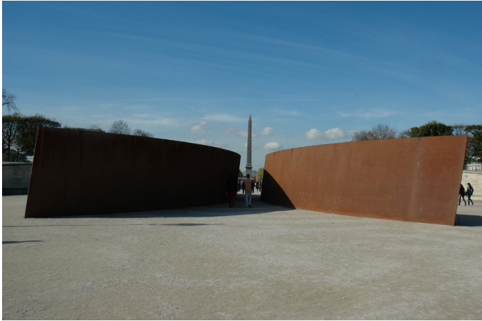
Figure 4. Richard Serra's Clara Clara in the Tuileries Gardens.