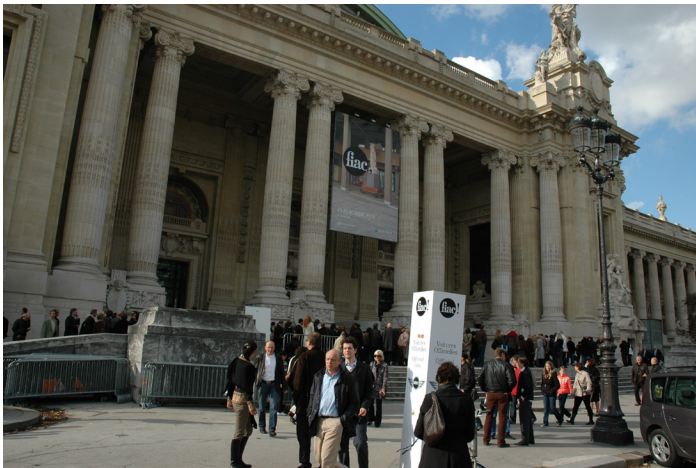
Figure 2. FIAC 2008 at the Grand Palais .

By placing cutting-edge art works in central historical locations, moreover, FIAC with the collaboration of the city of Paris, redefines those spaces, attracting the international press necessary