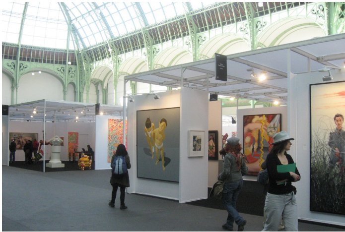
Figure 3. FIAC, 2008, interior of the Grand Palais .

reinforce feelings of change and innovation, expunging the image of a static city. By placing contemporary sculptures, installations, and video in parks and plazas, the city of Paris, and the French government, are “accessorizing” and transforming the older grand public parks and edifices with the contemporary.