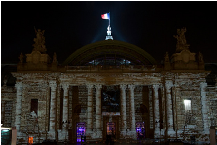
Figure 6. Dans la nuit, des images , Charles Sandison's manifesto Proclamation Solemne , 2008, illuminates the Grand Palais's façade at night. Photo: Collection Grand Palais, François Tomasi. Image reprinted with permission.

Dans la Nuit's predecessor is Nuit Blanche , a hugely successful all-night event conceived by Christophe Girard in 2002 and launched by Paris' mayor Bertrand Delanoë, that took art to the