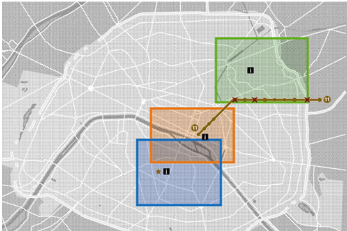
Figure 7. Nuit Blanche 2009 Parisian zones.

From well-known and shared places, such as the Parc des Buttes-Chaumont [in the nineteenth arrondissement], Luxembourg gardens... places of worship such as Saint Eustache, Notre-Dame,... the Great Mosque... to the Théâtre de la Ville... all will open their doors to contemporary art all night... From the historical center to the new breeding grounds for creation... Arcueil, Auberville, Clichy-la Garenne, Nanterre... Nuit Blanche will again be an integral part of Paris City Hall’s drive to give culture a greater place in the city. ( Nuit Blanche press release) (Figure 7)