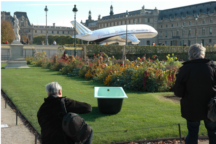
Figure 5. FIAC 2008, Tuileries gardens. Inflatable plane by Dutch artist Alexander Mir and bathtub by unknown artist in the foreground.