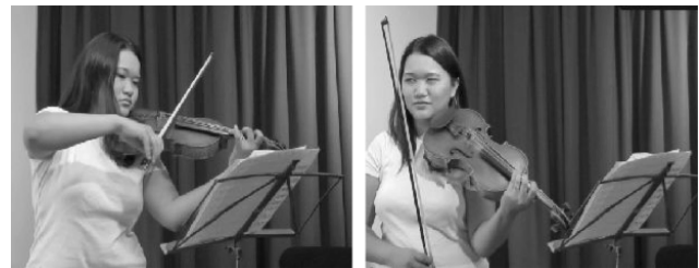
Figure 7: The student must switch gaze from score to screen.

The tutor could no longer directly annotate the student's score and it was noted that, in comparison to the co-present lessons, notes and annotations were not frequently made by either participant. One tutor made reference to a student's annotations where they were available on their photocopy of the student's music, confirming their value.