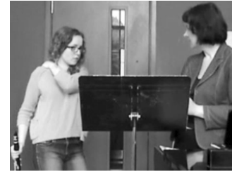
Figure 3: Moving out of the work zone.

The Work Zone The music stand became the focal point of a side-by-side F-formation (Kendon, 1990) as participants shared the student’s score, the o-space created between them being designated as a ‘work zone’ (Figure 2). In one example, towards the end of the lesson the student and tutor briefly relax into social conversation. The student moves back slightly and moves her upper body to face the tutor, rather than the music (position S2 Figure 2). The tutor moves her upper body to face the student, the stand no longer the focus of their o-space. The student rubs her shoulder and moves about, relaxing her muscles (Figure 3). The tutor then puts her left hand on the music stand, between two short utterances, whilst still maintaining eye contact with the student. In this way the tutor holds both the stand and the student, triangulating her position (Healey & Battersby, 2009) as she begins the transition back to the work zone. Finally, the tutor turns her head back towards the music stand, pulling her body round, facing back into the work zone (Figure 4). The student also turns back to the stand (position S1 Figure 2), and swings her clarinet up towards her face, having understood the signal that they are going to go back to work.