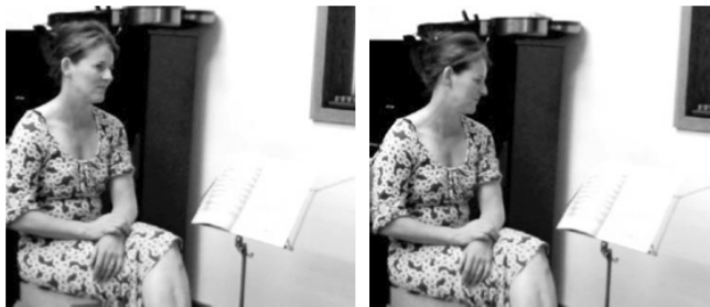
Figure 6: Tutor's gaze divided between screen and score.

wanted the student to stop playing, and when these were also unseen, resorted to a vocal request. This was sometimes not heard by the student who was absorbed in their playing and not facing the video conference system speakers, and the tutor had to raise their voice. Even when they were able to rapidly switch their attention, students missed cues through looking in the wrong place at the wrong time. From their perspective, they were continually being stopped unexpectedly by a raised voice, requiring a significant twist of their upper body to see the screen (Figure 7) and this quickly led to frustration.