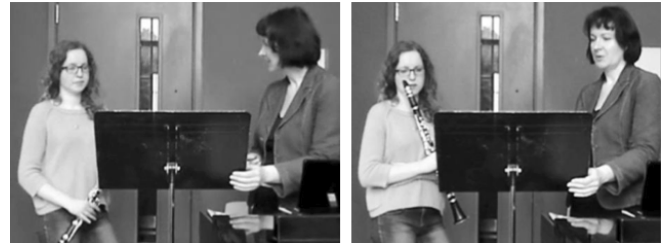
Figure 4: The tutor signals ‘back to work’.

The Listening Zone In each case, the tutor defined a listening zone (for example T1 in Figure 2). When the tutor occupied this zone, the student understood that they could play without immediate interruption as the tutor wanted to hear a longer section. The tutor also defined a listening position within the listening zone, for example one tutor stood with feet slightly apart, hands loosely folded in front of her body, shoulders relaxed; attending to, but not bidding for, the floor.