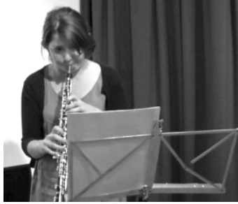
Figure 5: The score obstructs the camera view.

wanted the student to stop playing, and when these were also unseen, resorted to a vocal request. This was sometimes not heard by the student who was absorbed in their playing and not facing the video conference system speakers, and the tutor had to raise their voice. Even when they were able to rapidly switch their attention, students missed cues through looking in the wrong place at the wrong time. From their perspective, they were continually being stopped unexpectedly by a raised voice, requiring a significant twist of their upper body to see the screen (Figure 7) and this quickly led to frustration.