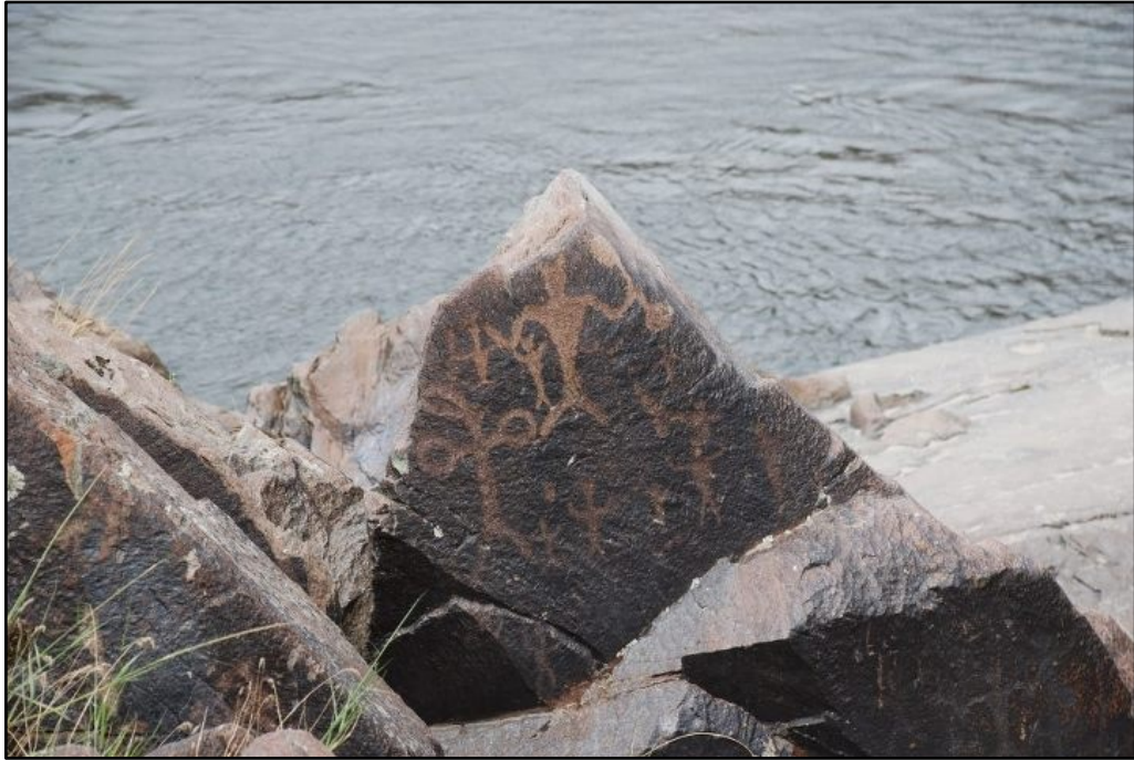
Figure 1. Buffalo Eddy Petroglyph on the Snake River, near Asotin, WA.

The event that has single-handedly compelled me to protect the cultural and natural resources and histories of Native Americans occurred on the traditional area that my clan frequented. I was a young child living on the Nez Perce reservation in Idaho; it was summer in the mid-1980s. Every summer my family travelled to Buffalo Eddy (see Figure 1.), a beach on the Snake River along the Washington and Idaho border. This spot contained the stories of my ancestors etched onto the black walls of the cliffs, they were beautiful, symmetrical, and asymmetrical at the same time: swirls, fish, people, and animals. The petroglyphs recreated vivid accounts of the past and of our people's accomplishments. I was completely amazed at what I saw and heard. I wanted to touch and feel the marks my ancestors left, but my Dad would not let us, instead he told us to feel the rock wall of the cliff and close our eyes and contemplate what we had taken in and the stories of