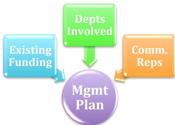
Figure 6. Variables Considered for Creating a Navajo centered Management Plan

The variables considered for this recommendation included the use of existing funding to complete such a task, the use of various internal Navajo Nation employees, and finally community representation. In order to create an inclusive Cultural Resources Management Plan, the Navajo Nation will need to utilize existing personnel and resources, in addition to reaching out to the local Navajo communities to identify shared concerns and questions about the management process. A CRMP should be a community-based process, as it is the Navajo people who should be the ones to identify, protect, and manage cultural resources in a culturally sensitive and appropriate manner. See Figure 6 below.