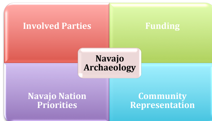
Figure 3. Variables Considered for Each Recommendation

scenarios. Each of these scenarios was weighed and considered, which led to the final recommendations provided to the NTC.