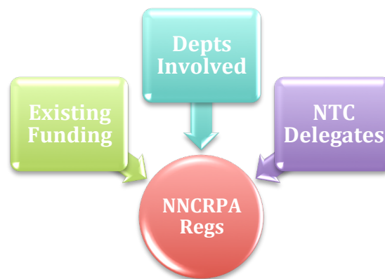
Figure 5. Variables Considered for Creating Regulations to the CRPA

research on Navajo lands. It was created in 1988 to protect cultural resources, to create a permitting system for research, and to create a civil penalty system to enforce the Act and to prohibit certain activities without the consent of the Tribal Historic Preservation Officer. The CRPA was created without accompanying regulations, which has caused many issues internal and external to the Navajo Nation. Variables involved in this recommendation center around funding, departments, and authority, which have a considerable effect upon the creation of regulations to this important piece of legislation, see Figure 5 below.