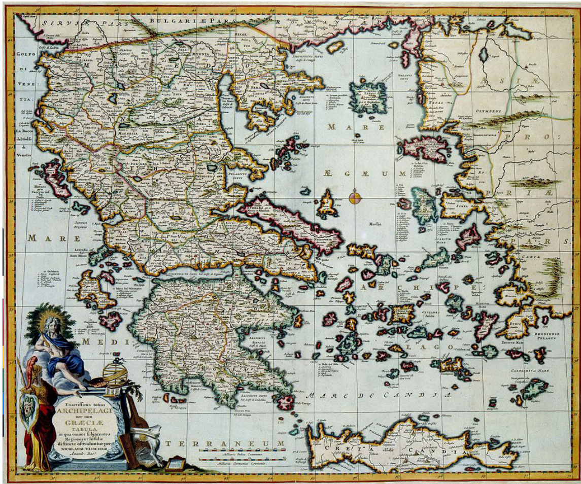
Figure 1. A map of the Aegean, by Nicolaum Visscher (1649–1702), published around 1681, illustrating a complex island region in which it is challenging to decide on archipelago or meta-archipelago membership from a biological perspective.

extend our analyses to encompass islands belonging to many sets of archipelagos (e.g., Bunnefeld and Phillimore 2012, Norder et al. 2018). This generates a further challenge, which is to determine the degree to which nearby archipelagos are truly independent ‘replicates’ as opposed to being interconnected by similar levels of information exchange as the islands within our archipelagos. As, increasingly, evidence of movement behaviours and of past propagule exchange and colonization events encoded in phylogenetic data