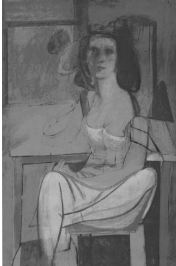
Seated Woman 1940

“Untitled #3,” 1986 next to “Woman,” 1949. Sometimes, as here, there seems to me an agonistic, even antagonistic, relationship between the older de Kooning and the youthful work he is conjuring up. All his previous brilliant habits as a painter—above all the hesitant, stop-and-start, open-and-close “de Kooning-type” drawing that other painters so idolized—are stripped down to their mellifluous dry bones. As if finally he found his famous 50s treatment of the female body not grotesque enough . So here it is again, done with no holds barred. It is as if he had