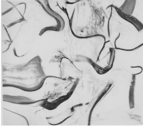
Untitled VI 1983