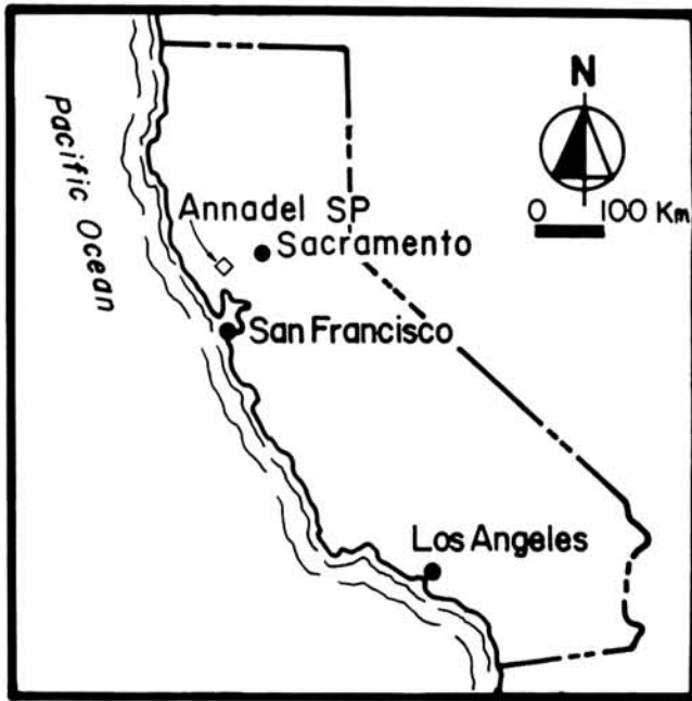
Fig. 1. Location of Annadel State Park.

logical sites. Most of the sites appear to be associated with the procurement of raw stone material. The EuroAmerican sites include numerous basalt quarries, and have been recently discussed by Chris Higgins (1983). Most of the native American sites are in one way or another associated with the local obsidian industry.