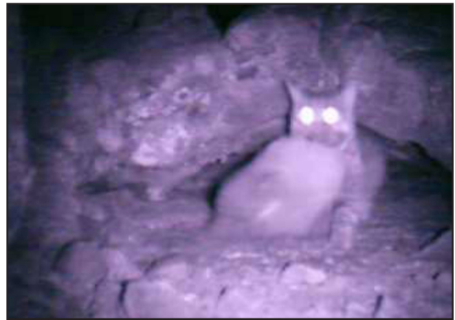
Figure 2. A feral cat ( Felis catus ) taking an endangered Hawaiian petrel ( Pterodroma sandwichensis ) nestling from its burrow on Mauna Loa, Hawai'i Island during a nighttime video segment illuminated by infrared light. The nestling, which is entirely covered in downy feathers, is held upside down by the cat and its head is facing the left side of the frame.