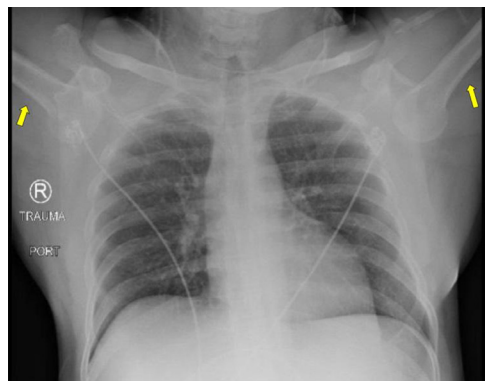
Image 1. The patient presented with his humeri in fixed abduction (yellow arrows).

A 53-year-old male with a history of diabetes presented to the emergency department (ED) with bilateral shoulder pain. He was the victim of a carjacking; he held on to his car as the perpetrator sped away, was subsequently dragged, and then run over by the vehicle. He presented with both arms fully abducted and fixed. Imaging revealed bilateral inferior dislocation of the glenohumeral joint consistent with bilateral luxatio erecta, which were reduced in the ED (Images 1-3).