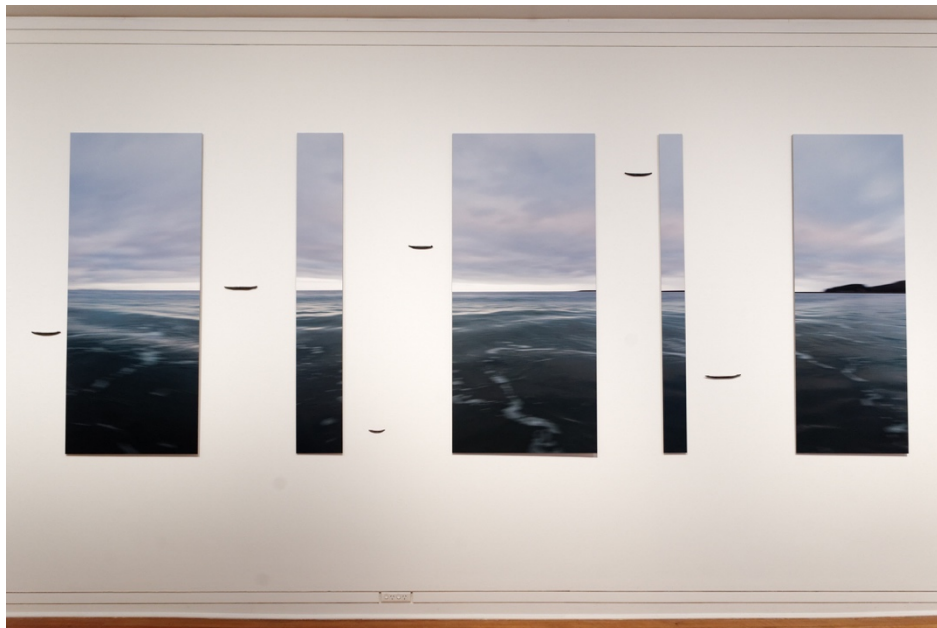
Figure 14. Simon Kaan (Kāi Tahu, Kāti Irakehu, Kāti Mako), Whakaruku (detail), 2021. Digital photograph on cotton paper, ceramic waka, dimensions variable. On view in Paemanu: Tauraka Toi , Dunedin Public Art Gallery, Dunedin, Aotearoa New Zealand, December 11, 2021 to April 25, 2022.