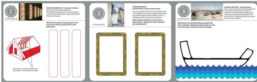
Figure 8. Educational activity sheets created for Paemanu: Tauraka Toi , Dunedin Public Art Gallery, Dunedin, Aotearoa New Zealand, December 11, 2021 to April 25, 2022.