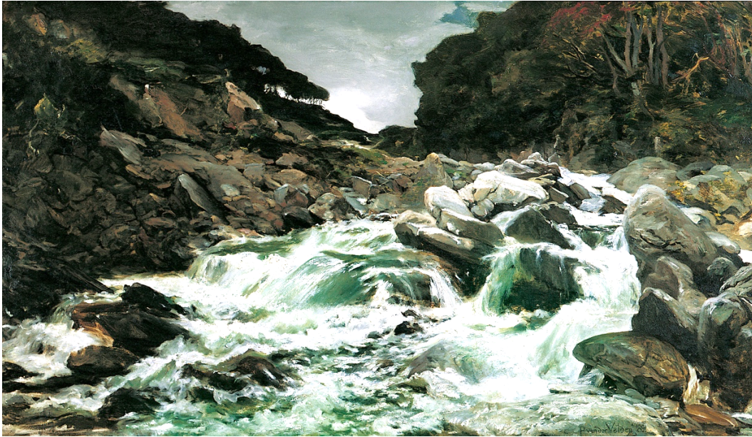
Figure 4b. Petrus van der Velden (Dutch/New Zealand 1837-1913), A Waterfall in the Otira Gorge, 1891. Oil on canvas, 1130 x 1935 mm, Dunedin Public Art Gallery, Dunedin, Aotearoa New Zealand.