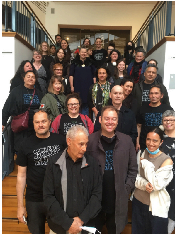
Figure 1. The Paemanu team and Dunedin Public Art Gallery staff at the opening of Paemanu: Tauraka Toi , December 11, 2021, Dunedin Public Art Gallery, Dunedin, Aotearoa New Zealand.

new collection of Kāi Tahu contemporary artworks created and owned by Paemanu artists; and Paemanu's self-determined exhibition at DPAG, Paemanu: Tauraka Toi—A Landing Place (December 2021–April 2022). This article discusses and celebrates the ways Kāi Tahu Māori contemporary visual culture has been elevated throughout DPAG for the first time in the institution's history.