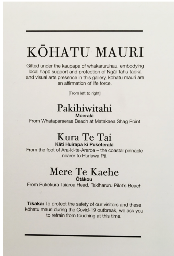
Figure 2b. Object label for the kōhatu mauri stones, Dunedin Public Art Gallery, Aotearoa New Zealand.

can move the stones; we can take them away temporarily on a trip, and we can even remove them permanently if we become unhappy with their situation.