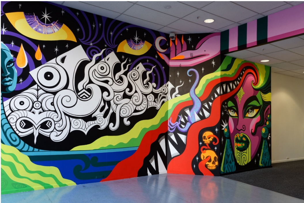
Figure 24. Zoe Hall (Kāi Tahu), Bloodline , 2022. Acrylic, mural installation view. Paemanu: Tauraka Toi , Dunedin Public Art Gallery, Dunedin, Aotearoa New Zealand, December 11, 2021 to April 25, 2022.