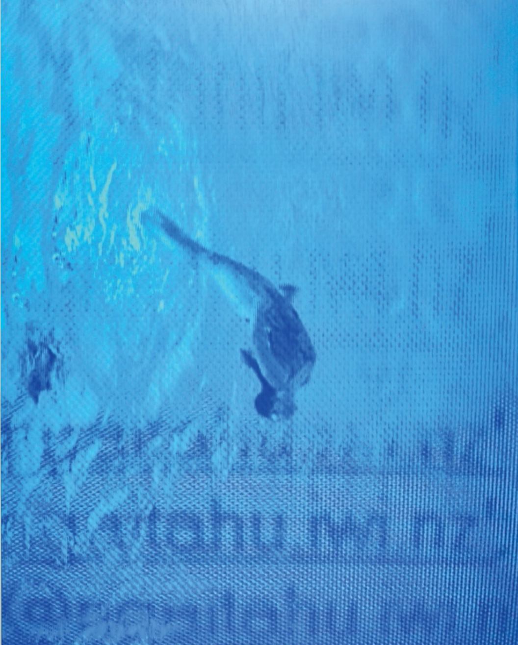
Figure 7a. Rachael Rakena (Ngāpuhi, Kāi Tahu), Iwidotnz 008 , 2002. Digital photograph on aluminium, 1250 x 1000 mm. On view in Paemanu: Tauraka Toi , Dunedin Public Art Gallery, Dunedin, Aotearoa New Zealand, December 11, 2021, to April 25, 2022.