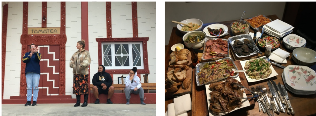
Figure 4. Wānanga (workshopping) at Ōtakou Marae, April 9–11, 2021.

The process of wānanga (meet and discuss) led to Paemanu identifying DPAG’s holdings—Dunedin’s beloved art collection, built on substantial philanthropy since the nineteenth century—as a colonial system of wealthy gift-giving and status. In those establishment years, DPAG’s high investment in cultural values as represented by European art and culture was made with the intention of educating the general public through access. However, because the founding ancestors of DPAG did not value and collect Indigenous artforms, none entered the collection. In more recent times, Kāi Tahu and Māori art has been exhibited but has remained underrepresented in the collection over its 137-year history.