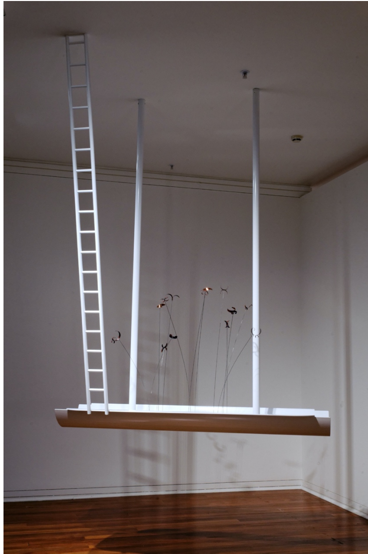
Figure 11. Areta Wilkinson (Kāi Tahu, Ngāti Kahungunu ki Wairarapa), Star Whata. Space Odyssey 2021 , 2021. Mixed media, 2600 x 1900 x 790 mm. On view in Paemanu: Tauraka Toi , Dunedin Public Art Gallery, Dunedin, Aotearoa New Zealand, December 11, 2021 to April 25, 2022.

and is already providing the Gallery with a visual educational resource about the Kāi Tahu creation narrative it represents (Fig. 24).