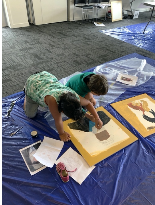
Figure 21. Public program of tūpuna (ancestor) portrait-making, Ōtakou Marae, January 29, 2022, in conjunction with the exhibition Paemanu: Tauraka Toi , Dunedin Public Art Gallery, Dunedin, Aotearoa New Zealand, December 11, 2021, to April 25, 2022.