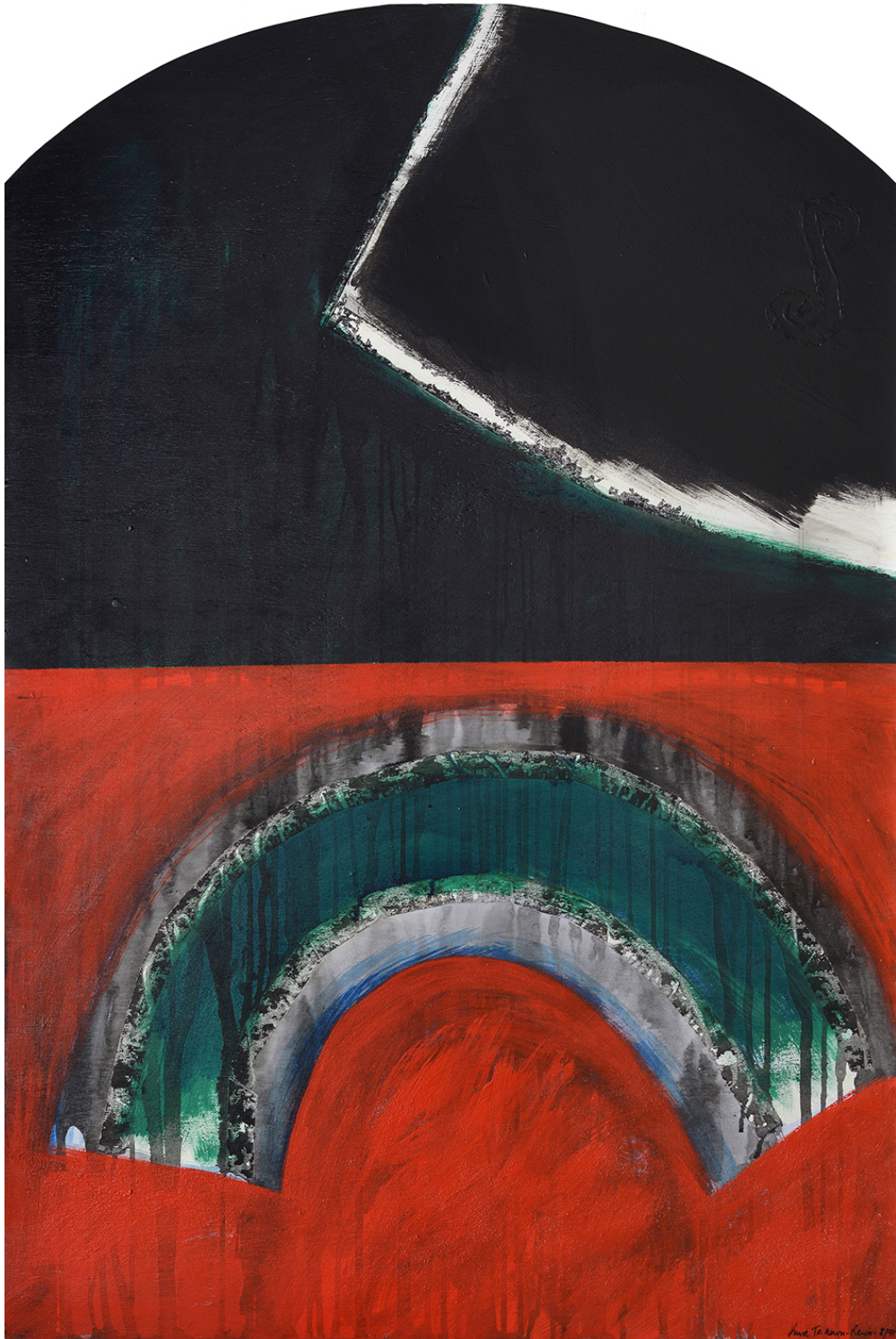
Figure 7c. Kura Te Waru Te Rewiri (Ngāti Kahu, Ngāpuhi, Ngāto Kauwhata, Ngāti Rangi), Untitled , 1991. Acrylic on plywood, 1295 x 799 mm. On view in Paemanu: Tauraka Toi , Dunedin Public Art Gallery, Dunedin, Aotearoa New Zealand, December 11, 2021, to April 25, 2022.