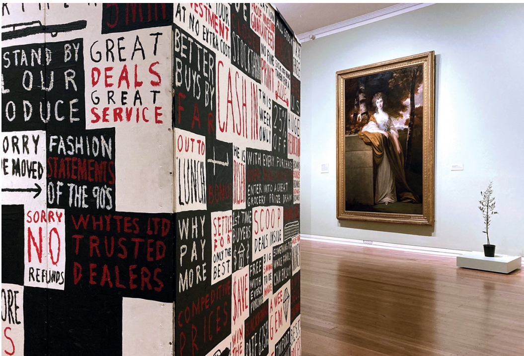
Figure 5. Left to right: Peter Robinson (Kāi Tahu, Kāti Kuri), Untitled , 1994. Wood, acrylic, oil stick, light bulb, tin, wool, 210 x 1630 x 1700 mm; and Thomas Gainsborough and John Hoppner, Charlotte, Countess Talbot , c. 1784. Oil on canvas, 2720 x 1810 mm. Michael Parekōwhai (Ngā Ariki, Ngā Tai Whakaronga), Constitution Hill , 2011. Bronze 1010 x 250 x 250 mm. On view in Hurahia ana kā Whetū: Unveiling the Stars , Dunedin Public Art Gallery, Dunedin, Aotearoa New Zealand, June 12–April 30, 2023.