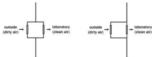
Figure 4 Diagrams used in the afforded condition (left) and the unafforded condition (right) of Experiment 2.

In one condition (the afforded condition) participants were given a redundant-door diagram showing a door vestibule bisecting a wall bounding the lab. In the other condition (the unafforded condition) participants were given a diagram showing the same door vestibule abutting the wall (Figure 4). The number and type of elements were the same in both diagrams, ensuring that differences in performance could not be attributed to differences in the number or type of unalignable objects. Although both diagrams are single-space configurations according to the coding scheme used in Experiment 1, they differ in their physical affordances, particularly in how the vestibule is perceived in relation to the wall. In the afforded condition, the wall and the vestibule are meant to be perceived as overlapping, following the Gestalt law of continuation. In the unafforded condition, by contrast, the vestibule is meant to be seen as resting up against, or attached to, the wall. The diagram in the unafforded condition should thus be harder to imagine moving because it is encumbered by (or anchored to) the lab space, in turn making it harder to align with the pole problem. Following this reasoning, we predicted that participants in the unafforded condition would be less likely to produce an analogous solution to the pole problem than those in the afforded condition.