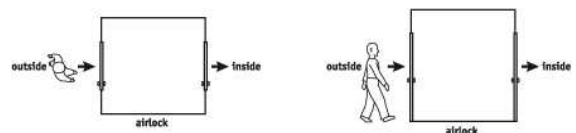
Figure 5 Diagrams used in the afforded condition (left) and unafforded condition (right) of Experiment 3.

Another notable finding in Experiment 1 was that participants who drew plan diagrams were more likely than those who drew diagrams from other views to produce analogous solutions to the pole problem. We argued that it was easier to perceptually simulate doors opening in plan and hence easier to simulate the action required to solve the pole problem. We also argued that it might be easier to transform a simulation of a redundant-door solution if the simulation was not perceptually structured in relation to gravity, or, in other words, if all spatial relations were orthogonal to gravity. To test this claim, we repeated Experiment 2 with two new redundant-door diagrams: one drawn from the side (unafforded condition) and one drawn from above (afforded condition) (Figure 5). Consistent with the arguments put forth in Experiment 1, we predicted that participants in the afforded condition would be more likely to produce an analogous solution to the pole problem.