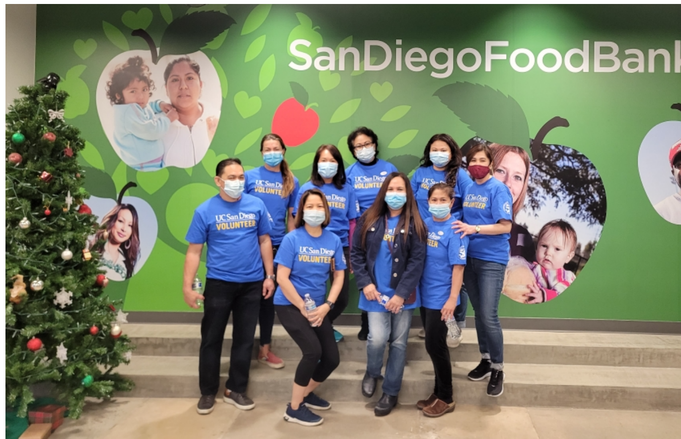
UCSDH Perianesthesia department volunteering at the San Diego Food Bank