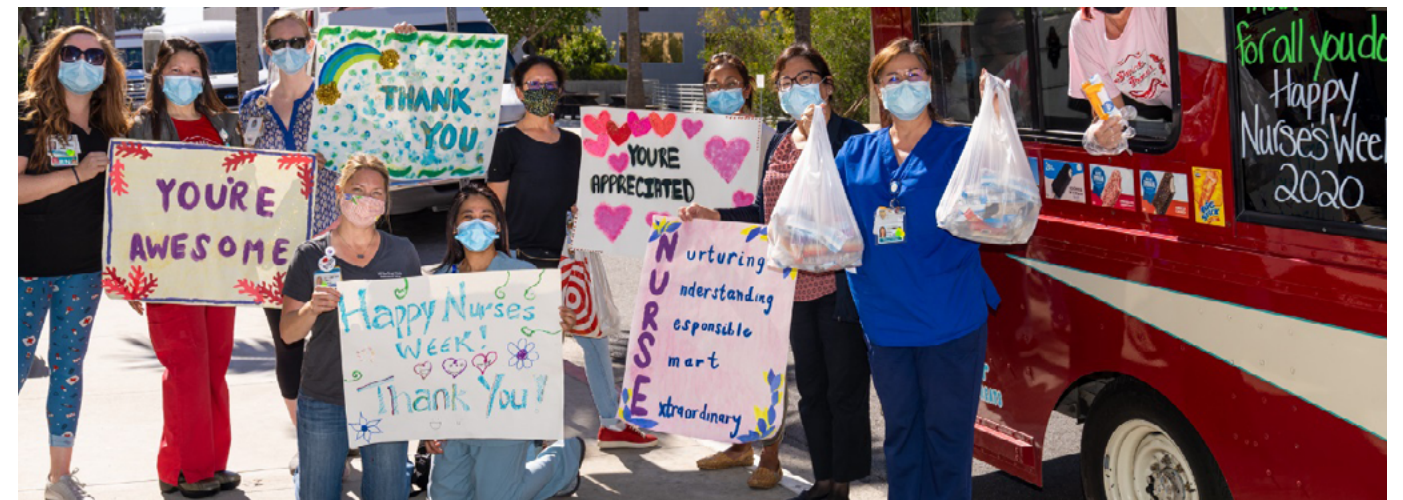
2020 Nurses Week