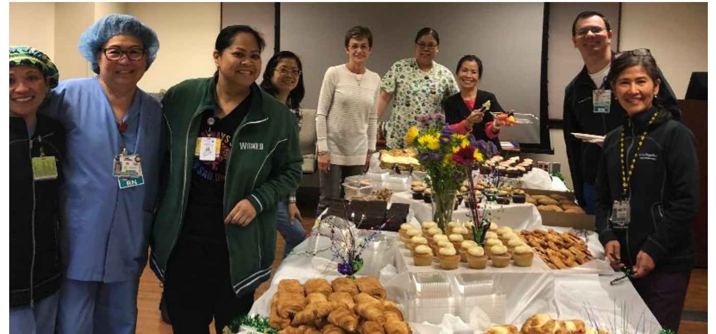
Certified Nurses Day