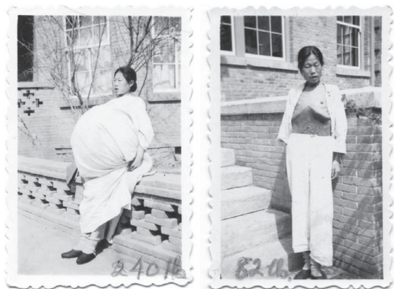
Figures 6a, 6b

written first in pencil and then traced over in blue ink, as if the photographer was worried that the pencil would rub off over time. A scribbled caption on the “before” photograph states, almost enthusiastically, that “The ovarian cyst weighed more than the pt. [patient] after operation.” 39 Strangely, existing textual documentation about the removal of the massive ovarian cyst is sparse. Neither Harold Henke nor Ralph Lewis bring up the incident in their writing and Jessie Mae Henke briefly mentions it only once in her recollections; the medical reports from 1931 and 1939 are also silent. 40 As