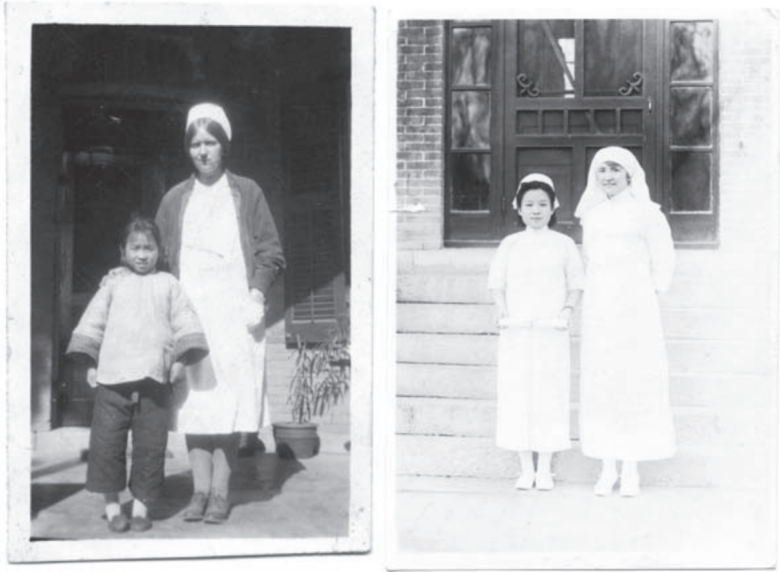
Figures 8a, 8b