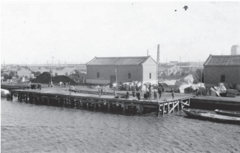
Figure 1 (Henke Collection)

The nameless individuals represent a photographic microcosm of the world that the Henkes were about to enter. Six foreign men dressed in suits and fedoras stand with hands in pockets at the part of the dock closest to the approaching ship, one of them leaning