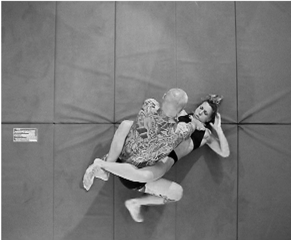
Jennifer Locke, Match , single-channel looping video projected onto floor, 6:16, 2005.

1 2 3 4 5 6 7 8 9 10 11 12 13 14 15 16 17 18 19 20 21 22 23 24 25 26 27 28 29 30 31 32 33 34 35 36 37 38 39 40 41