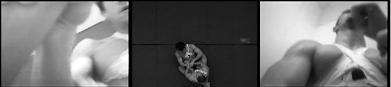
Jennifer Locke, Minicam II , single-channel looping video, 11:45, 2006.

25 26 27 28 29 30 31 32 33 34 35 36 37 38 39 40 41