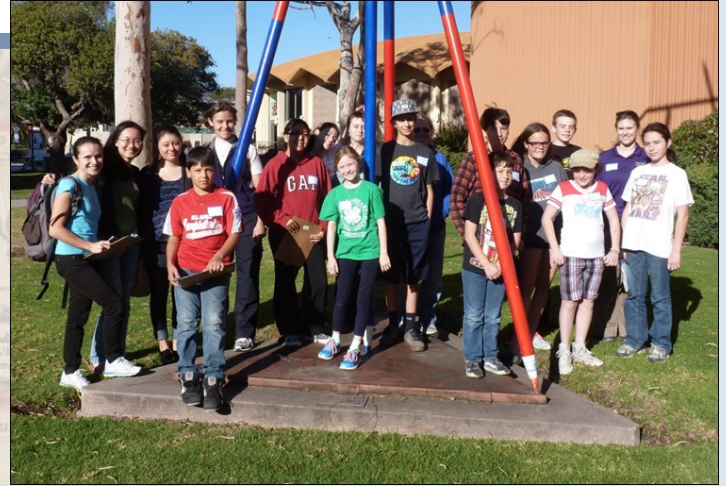
Figure 1. Day 1, ready to go!

Kitty Currier, Center for Spatial Studies