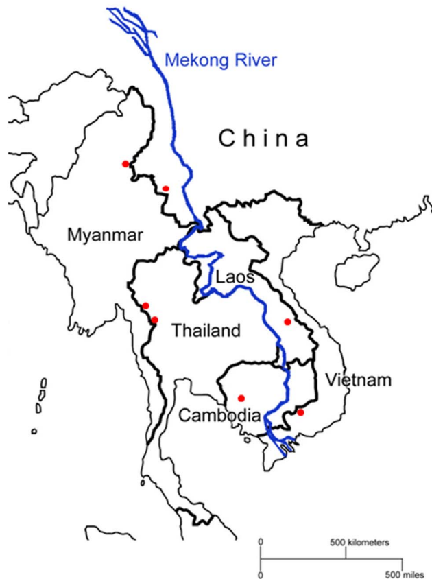
Figure 1. Map of the GMS. Origins of parasite samples are marked as red dots. The Mekong River is shown in blue. doi:10.1371/journal.pone.0059192.g001

The exact mode of antimalarial action of ART drugs is still under debate [14]. It has been proposed that ARTs target the sarcoplasmic/endoplasmic reticulum \text{Ca}^{2+} ATPase (PfSERCA or PfATP6), since the heterologously expressed PfATP6 in Xenopus laevis oocytes can be inhibited by ARTs as well as thapsigargin, a sesquiterpene lactone that specifically inhibits mammalian SERCAs [15]. Furthermore, replacement of leucine at codon 263 with glutamate, which is predicted to be located in the ART-binding site, causes abrogation of inhibition of PfATP6 [16]. However, introduction of the L263E mutation in P. falciparum through allelic exchange did not result in similarly dramatic changes in parasite's susceptibility to ARTs [17]. So far, mutations at position 263 have not been detected in field isolates from regions with suspected ART resistance. When comparing sensitivities to ARTs in field isolates from Cambodia, French Guiana, and Senegal, Jambou et al. found a S769N substitution in a limited number of parasite field isolates from French Guiana, which was associated with significantly reduced in vitro susceptibility to artemether [18].