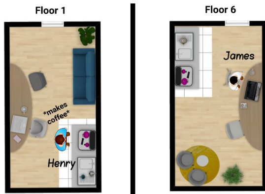
Figure 3. Scenario “Coffee Machine” with fixed Agent 1 (“Henry”) and varied Agent 2 (“James”).

We used the same Causal Rating Measures and Manipulation Checks as in in Experiment 1.