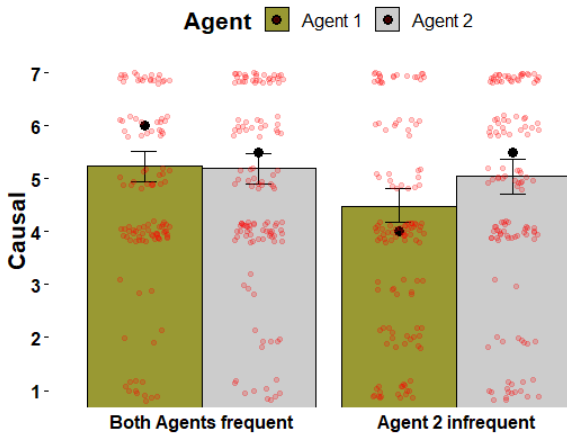
Figure 4. Mean agreement ratings (scale 1-7) for causal statements. Error bars represent \pm 1 SE mean, black points represent the median.

using the other relevant device on Friday ( M = 4.61 , SD = 2.01 , 95% CI [4.29, 4.93]), than vice versa ( M = 2.53 , SD = 1.83 , 95% CI [2.24, 2.82]).