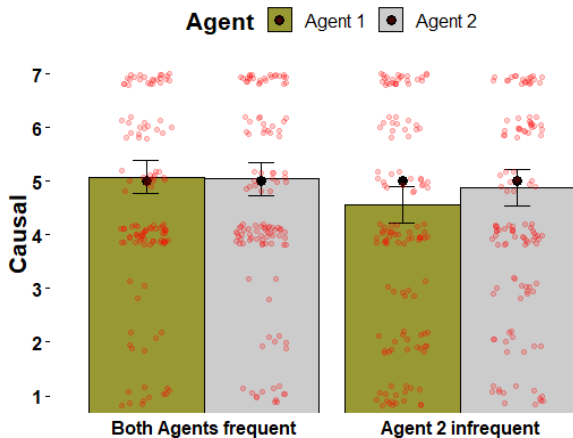
Figure 4. Mean agreement ratings (scale 1-7) for causal statement. Error bars represent \pm 1 SE mean, black points represent the median.

A Mixed ANOVA for participant’s agreement ratings about the causal statements revealed a main effect for Frequency F(1,150) = 9.96, p = .002, \eta_p^2 = .06 . Higher causal ratings are given when both agents act frequently ( M = 5.07, SD = 1.87, 95\% CI [4.87, 5.28] ), compared to the case in which only one has acted frequently ( M = 4.72, SD = 2.06, 95\% CI [4.60, 4.93] ).