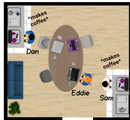
Figure 5. Scenario “Coffee Machine” with fixed Agent 1 (“Dan”), varied Agent 2 (“Eddie”) and ‘auxiliary’ Agent 3 (“Sam”).

We used the same Causal Rating Measures as in Experiment 1, but for the sake of completeness, added a Causal Rating for Agent 3 which we did not include in our analysis. We added a Manipulation Check Question to test whether people correctly perceived who had acted on the final day of the outcome [“Who used a microwave on Friday?” ‘Agent 1’, ‘Agent 2’, ‘Agent 3’, multiple answers possible]. We changed our Epistemic Question into a question about i) the type of behaviour “Agent 1 (2) knew that the other coffee machine (microwave) would be used by someone on Friday”, and ii) the behaviour of the specific agent “Agent 1 (2) knew that Agent 2 (1) would use the other coffee machine (microwave) on Friday” [1 – ‘strongly disagree’ to 7 – ‘strongly agree’].