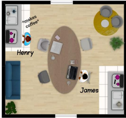
Figure 1. Scenario “Coffee Machine” with Fixed Agent (“Henry”) and varied Agent (“James”).