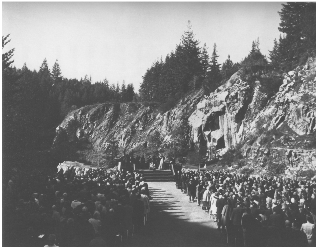
Charter Day Ceremonies Upper Quarry January 14, 1967