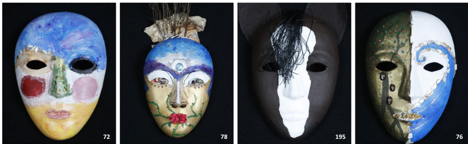
Fig. 2 Examples of Student Masks

I ate the pancakes like I was supposed to EVERY DAY. A pancake a day to keep the test takers away And I guess they never told me that I would get tired of pancakes While my grandma was sick with the flu I ate pancakes When my cousin celebrated his 8 th birthday I ate pancakes When my mom called to ask why I didn't come home I ate pancakes As I consumed pancakes, they consumed me So this is an ad for pancakes I'm looking for someone who wants to try pancakes I've got loads to spare I've learned that eating pancakes alone is just too great a task If you have additional ingredients, a new idea On how to make pancakes great again Give it to me for my pancakes Med School is like a tack of pancakes Might as well have a pancake party