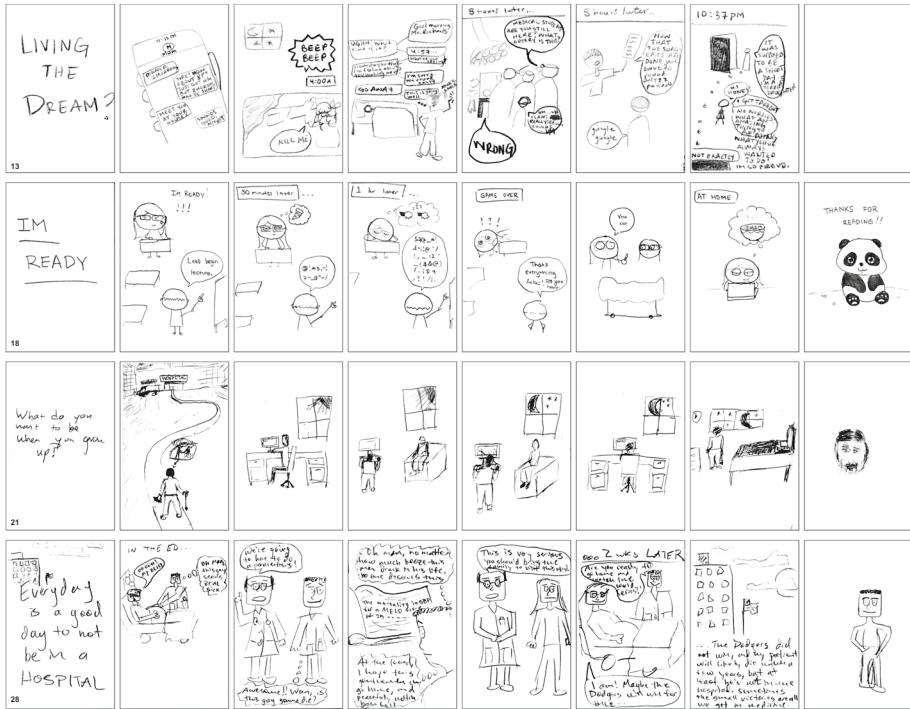
Fig. 3 Examples of Student Comics