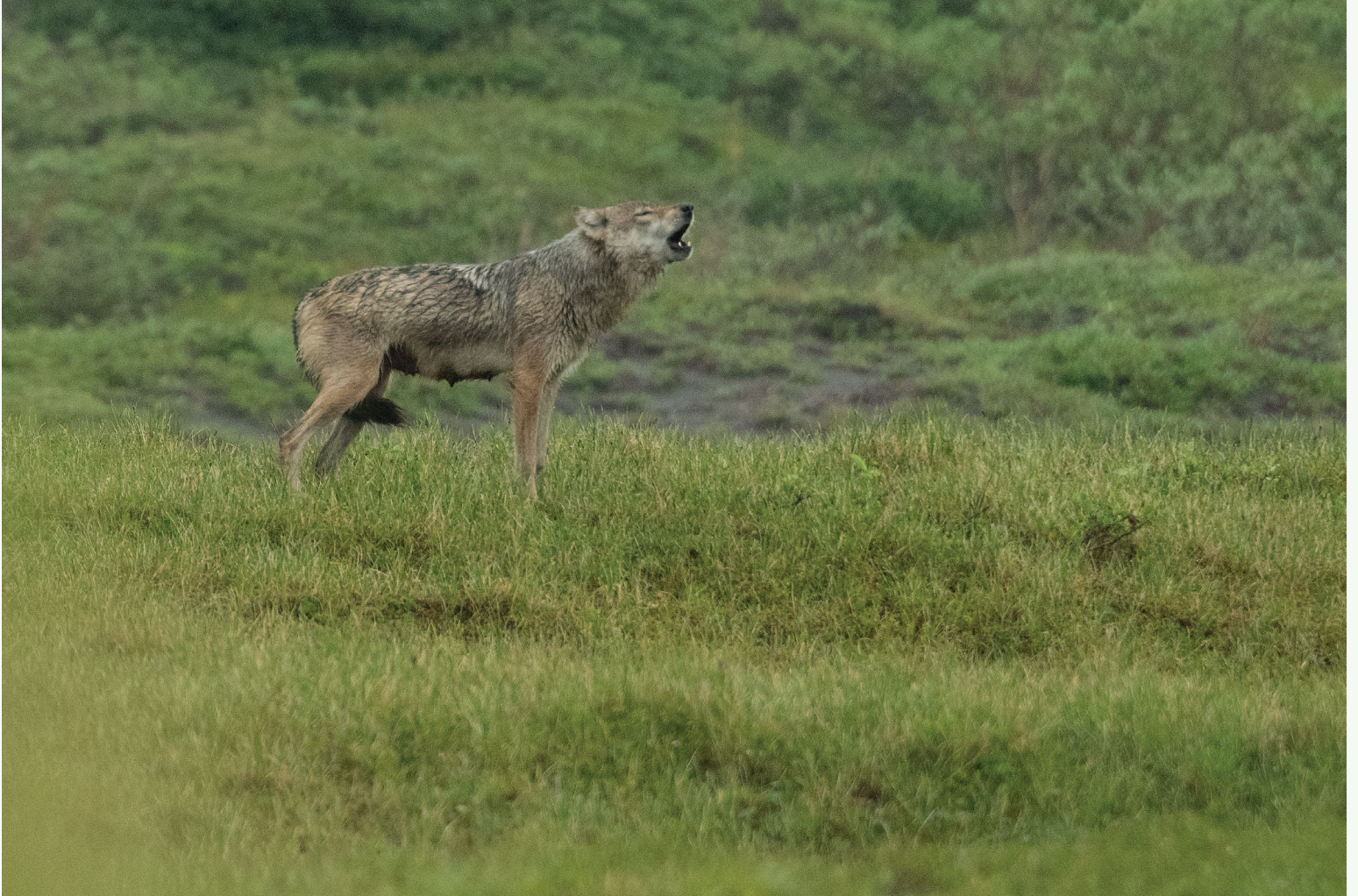
The alpha female of the wolf pack.