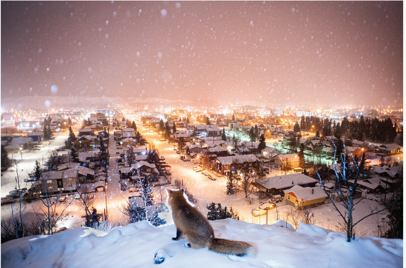
A red fox on the clay cliffs above the city of Whitehorse, Yukon Territory. We can only guess whether it recognizes a boundary between places where people are predominant and the surrounding countryside.