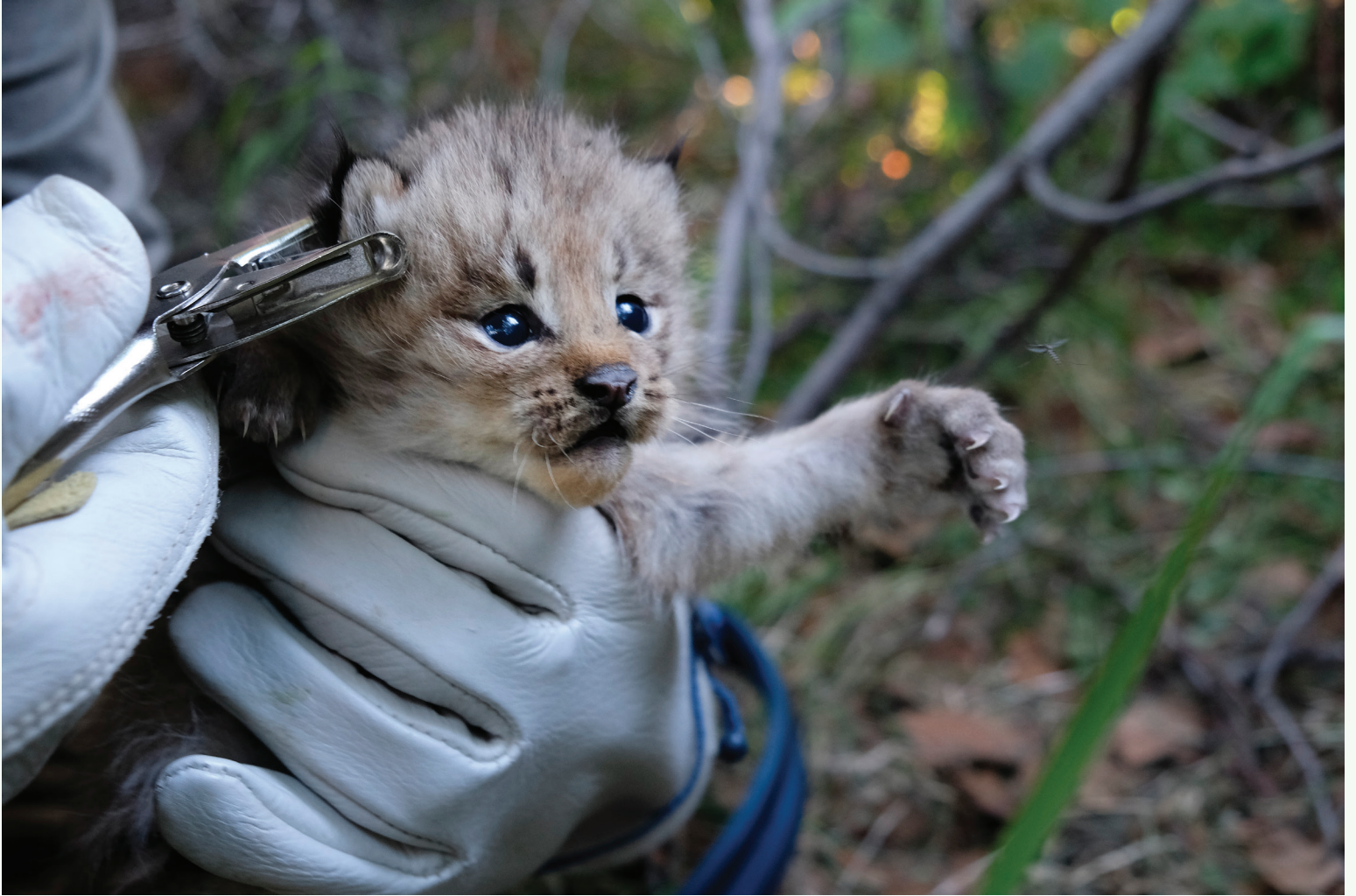
A lynx kit on the edge of ANWR gets ear-tagged by university students who are studying the dispersal of the species. Recently, lynx are being seen and tracked regularly along the Arctic Coast, north of their usual habitat. Another boundary broken with the help of our changing climate.