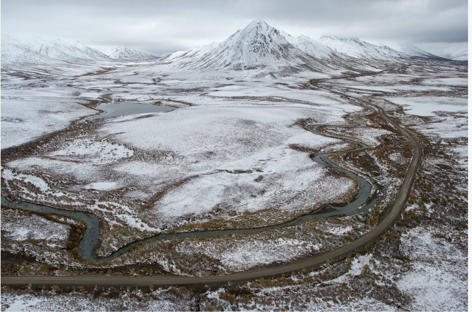
The Dempster Highway cuts through the Tombstone Territorial Park, and begs the question: What are bigger boundaries for wildlife: roads and other human structures, or rivers and mountains—the boundaries of the natural landscape?