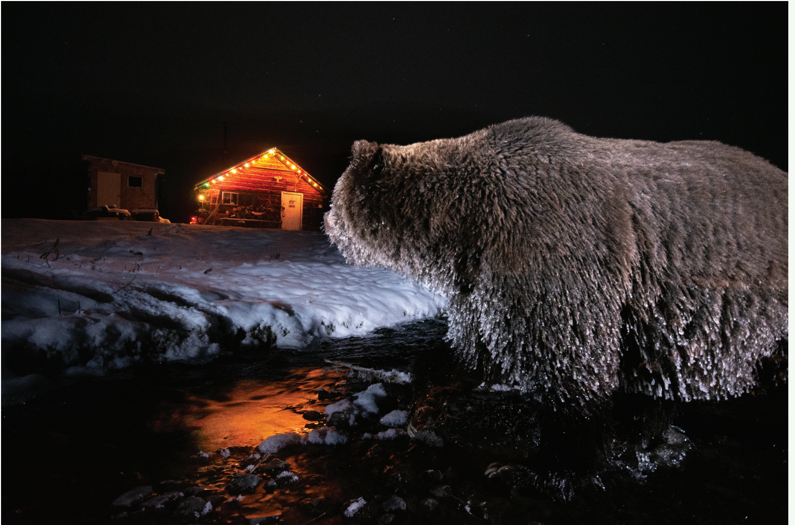
In the seasonal fishing village of Klukshu, on the edge of Kluane National Park and Reserve. The river serves as the unofficial boundary between the bears and the people.