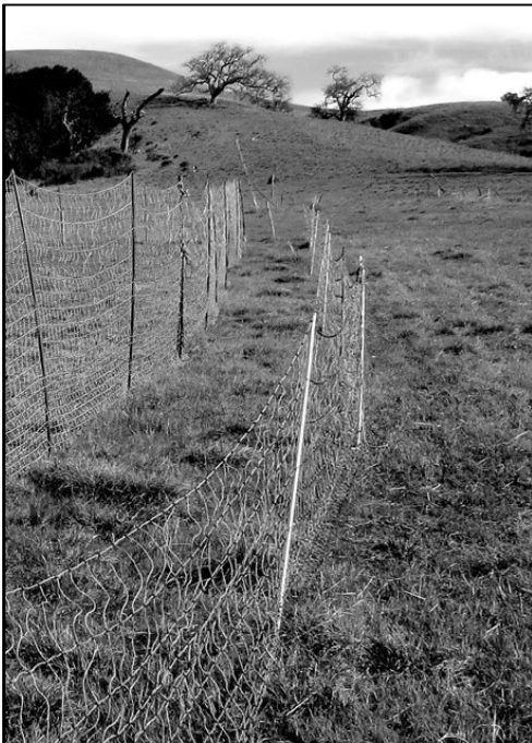
Figure 2. Double electric mesh fence night pen. A 1.5-m-high electric net fence forms the interior boundary with a 0.9-m-high electric net fence surrounding the interior fence.

Two Maremma LGDs were placed in the night pen with the goats to discourage the predators and alert the herders of predator presence. When we anticipated storm systems, the night pen was located away from woodland and brushy habitat that could provide predators with stalking cover. On each of the corners of the night pen we deployed Reconyx PC800 HyperFire Professional Semi-