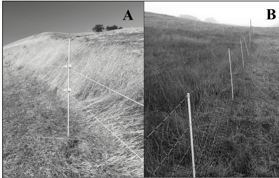
Figure 1. A) Electrified polywire with fiberglass posts. B) Electrified mesh fence.

mesh fencing (Figure 1). Each has strengths and weaknesses, depending on the species of livestock and predators involved.