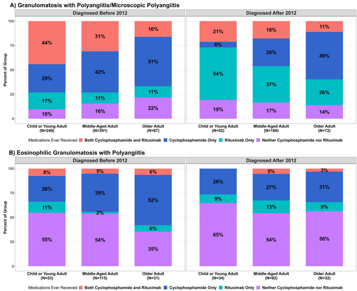
Figure 2. Medications ever received by patients with granulomatosis with polyangiitis and microscopic polyangiitis (GPA/MPA, A) and eosinophilic granulomatosis with polyangiitis (EGPA, B) stratified by age at diagnosis before and after 2012. Patients diagnosed during the year 2012 are included in the “Diagnosed Before 2012” category.