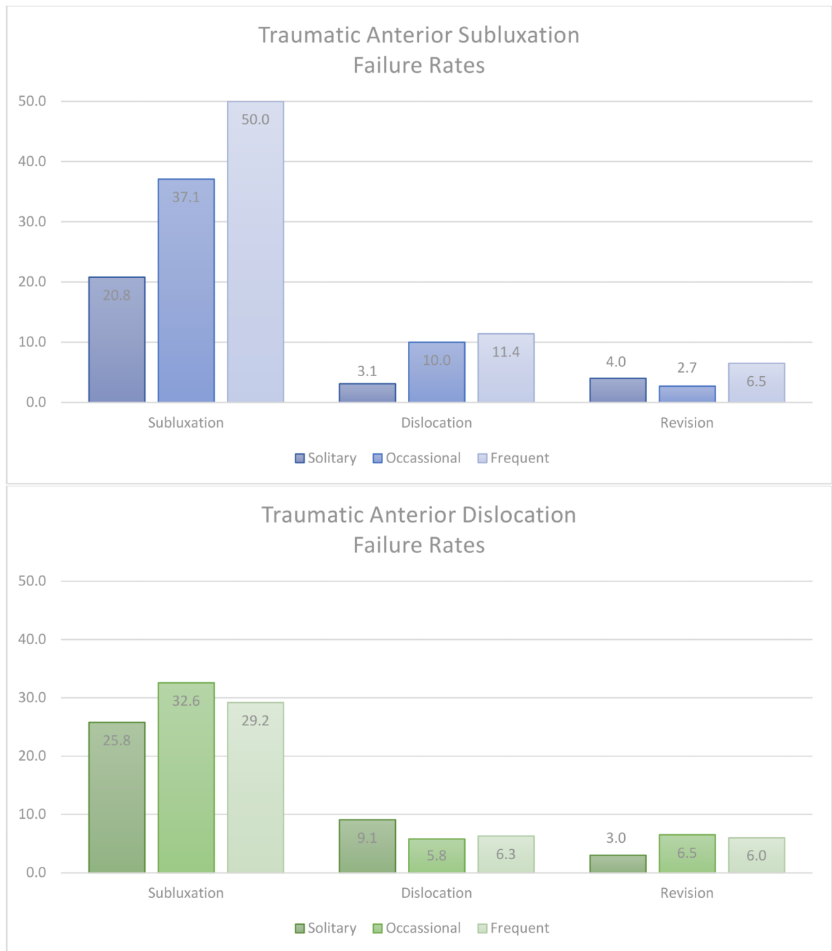
Figure III. Traumatic Anterior Subluxation and Dislocation 2 Failure Rates by Frequency a a Reported as %