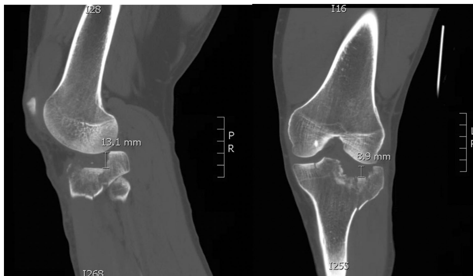
Fig. 2 Sagittal and Coronal CT of the knee demonstrating articular depression measured on both views with 13.1 mm of depression on the sagittal, 8.9 mm depression on coronal imaging