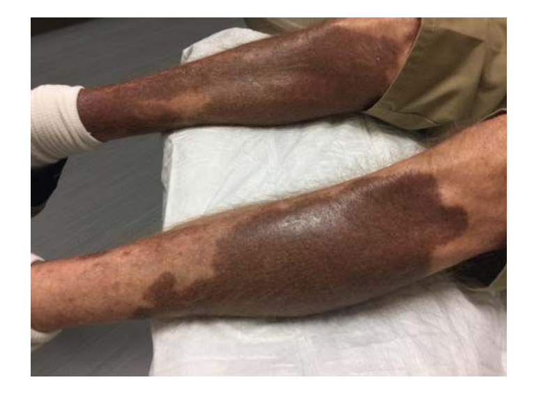
Figure 1 . Drug-induced hyperpigmentation. Well-demarcated violaceous to hyperpigmented confluent patches on bilateral distal lower extremities.

A 75-year-old man with a history of myelodysplastic syndrome presented to the dermatology clinic with a one-year history of progressive darkening of his lower legs. The patient denied a history of trauma and other associated symptoms including pruritus and pain. There had been no preceding edema or hyperpigmentation. He had been taking hydroxyurea for several weeks prior to the onset of the hyperpigmentation. Other medications included garlic tablets, levothyroxine, "Liver Defense" tablets,