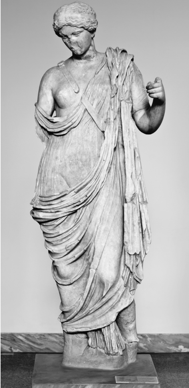
Fig. 4: Aphrodite-at-Arms, from Epidauros. Roman copy, original ca. 400 B.C. Athens, National Museum 262.