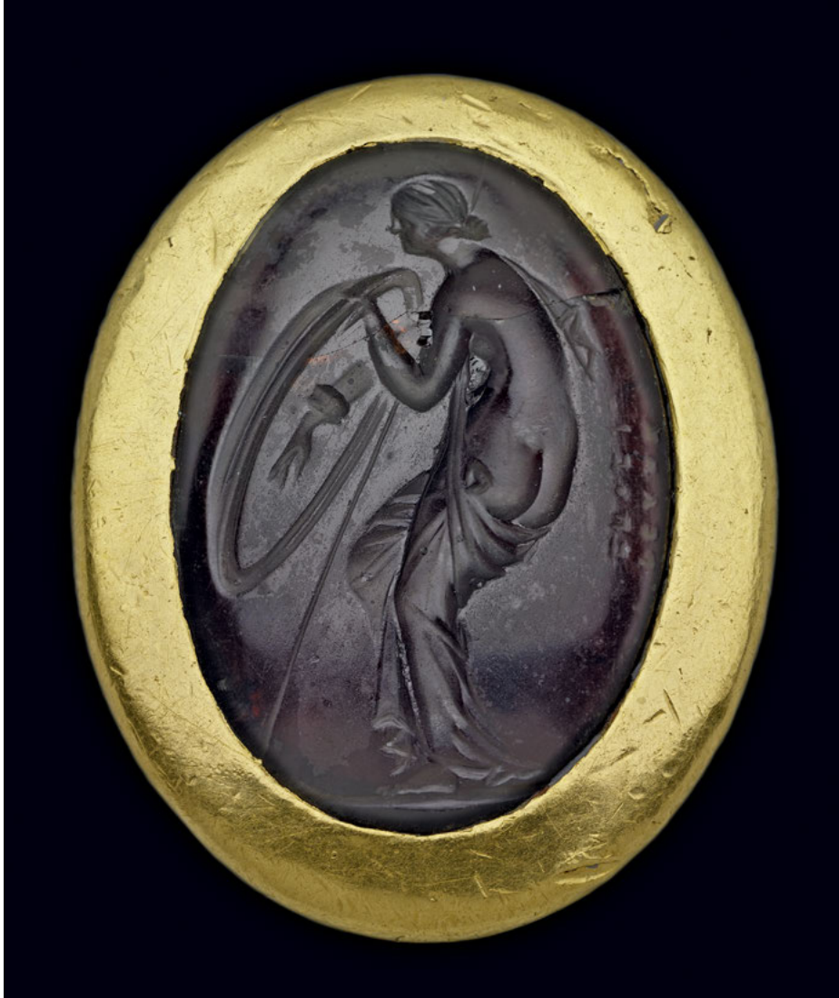
Fig. 5: Garnet ring stone signed by Gelon, from the Tomb of the Erotes at Eretria. Ca. 250–200 B.C. Boston, Museum of Fine Arts 21.1213.