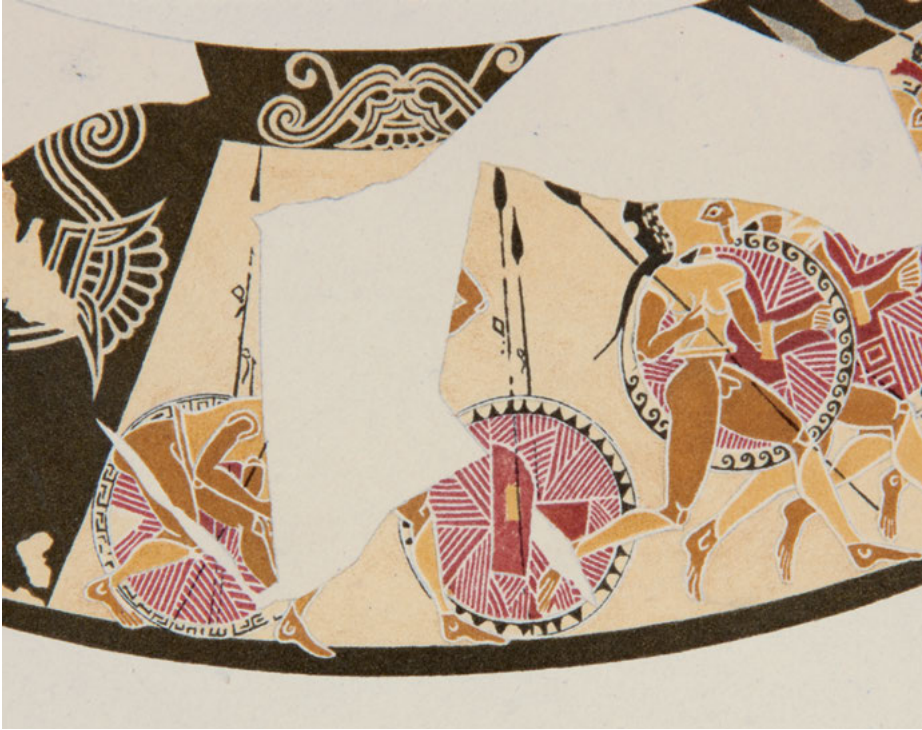
Fig. 2: Middle-late Protocorinthian olpe, the “Chigi Jug”: Hoplite battle, left side. Ca. 650 B.C. Rome, Villa Giulia 22679.

from using these spears for stabbing, “the two front lines are about to hurl javelins at each other, and contrary to appearances are evidently meant to be standing some way apart.” 7