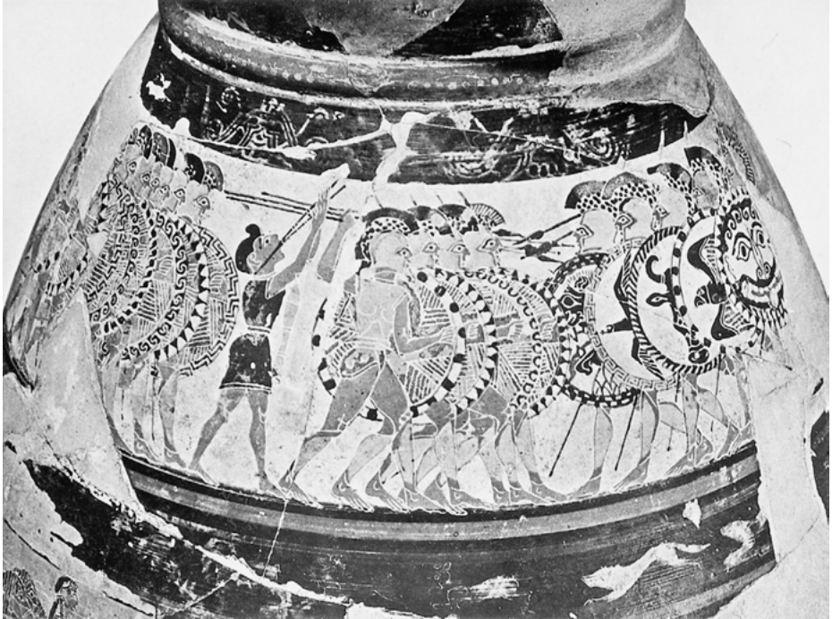
Fig. 1: Middle-late Protocorinthian olpe, the “Chigi Jug”: Hoplite battle, center. Ca. 650 B.C. Rome, Villa Giulia 22679.

schers allowed that in certain respects the picture seems to illustrate a phalanx that still had some way to evolve, since (echoing Homeric practice) all of the soldiers carry a second, backup spear and two of them at far left still have throwing loops attached to their spear shafts (Fig. 2).