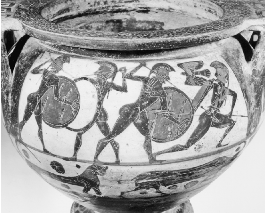
Fig. 3: Middle Corinthian column-krater: Hoplite battle. Ca. 600–575 B.C. Berkeley, Phoebe Apperson Hearst Museum of Anthropology 8/361.

men 9 . Add a corpse at their feet, and we understand the immediate reason for the encounter. Add a woman behind each of them tearing her hair or otherwise gesticulating, and we remember that somewhere – at home, or on the city wall – their respective womenfolk are anguishing over the outcome. Add another duel where one man has turned to flee and is being speared through the thigh (Fig. 3, right), and we recall that some warriors in this situation are less strong, less brave, and less lucky than others. Add a bird flying towards the victor (Fig. 3, right), and we see that the omens, and thus the gods, are on his side – the side of the bravest and strongest. In each case the logic is primarily causal, not temporal and/or spatial, and the governing theme is simple: hoplite battle. Time and space are secondary, even irrelevant to these very literal messages about it, and Aristotle’s notorious trio of classicizing unities lies far in the future 10 .