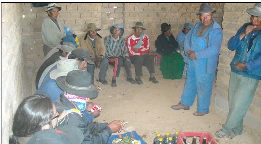
Figure 2: A community meeting about building the museum

While working at the site of Kala Uyuni we engaged with the community of Coa Collu, who were engaged and interested in our research. One major outcome of that work was the plan to build a local museum. In 2009, TAP initiated discussions with the community and others in La Paz to make plans for this museum. The community chose a place between the two major sectors of the site, and the construction began in 2010, seen in Figure 2. The community contributed adobe bricks and TAP gathered funds to pay for the maestro to oversee construction (seen standing in blue overalls), as well as Factum X, a Bolivian group, provided the architectural plans.