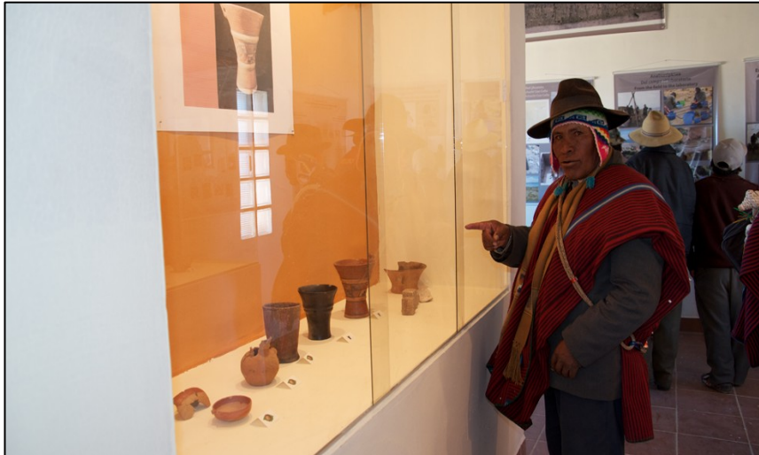
Figure 3: The opening of the museum and the community's visit

The building was inaugurated in 2012 with an official opening and festival (Figure 3). That entailed having the interior completed and the displays that were created by TAP members installed. Further, all of the excavated artifacts were stored in the back deposit in the same building. On the day of the inauguration, there was a community gathering, opening, meal, and tour of the museum. Figure 3 shows one of the community leaders, discussing the ceremonial vessels uncovered in the excavations.