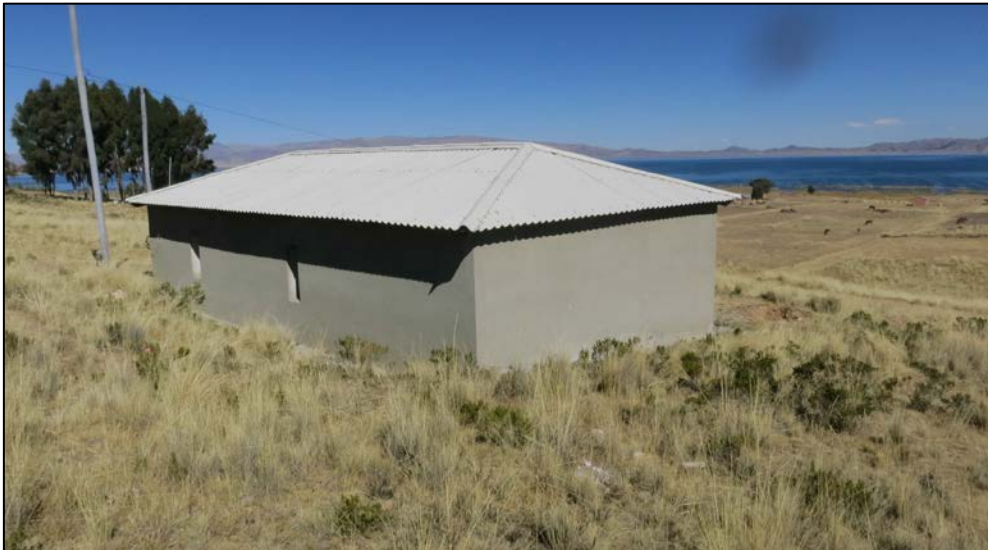
Figure 5. The Coa Collu museum in 2015 with the outside finished.

With Stahl funds, in 2015, we were able to see the exterior completed, as illustrated in Figure 5. The remaining work is to revise the display cases, as some were poorly constructed. Further we want to add a bathroom and place to sit outside for visitors. These are planned to be completed in 2016. TAP and the community are planning an open day in July 2016 to present the material to the school classes, once these cases are completed.