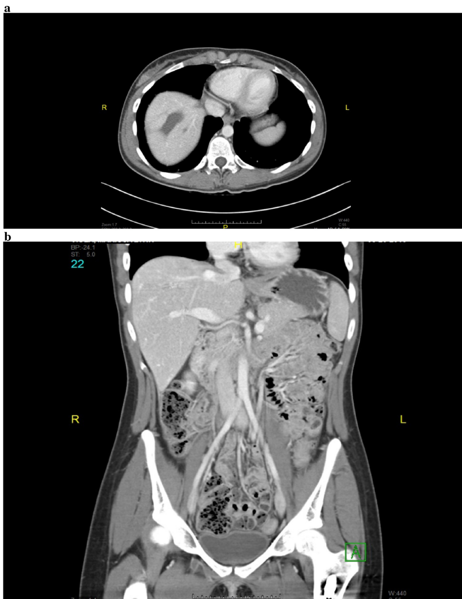
Fig. 3. a. Axial computed tomography image taken approximately 6 month after the initial caval injury demonstrates interval resolution of the traumatic pseudoaneurysm of the suprahepatic inferior vena cava (IVC); b. Coronal image demonstrates resolution of the IVC at the confluence with the hepatic veins.

review of the limited cases available in the literature shows patient presentation and pathogenesis of the aneurysms are diverse. In search of some predictability, it seems as though location of the aneurysms can be tied to the mechanism in traumatic caval injury. Caval injury caused by blunt abdominal trauma results in injury of the IVC at the retrohepaticor-intrahepatic regions of the IVC.