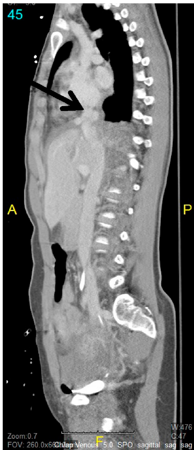
Fig. 2. A sagittal image from the patient's repeat computed tomography study demonstrates stable pseudoaneurysm along the confluence of the suprahepatic inferior vena cava (IVC).

CT, obtained 6 month (Fig. 3) later, demonstrated resolution of IVC pseudoaneurysms.