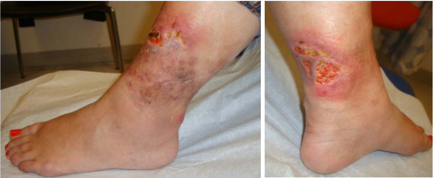
Figures 1, 2. Ulcers within erythematous plaques

Vasculitis is not identified. Although special stains for microorganisms that include Gram's, periodic acid-Schiff with diastase, and acid-fast bacilli are negative, the most recent tissue culture is positive for Mycobacteria avium complex, and the histologic findings are consistent with a mycobacterial infection.