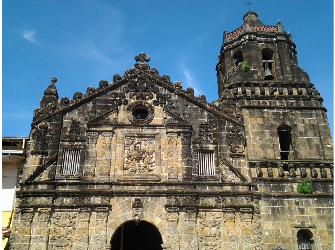
Figure 4: St. James Church in Paete, Laguna. While the original church was built in 1646 it was destroyed in 1717; a new church was begun that same year but left incomplete until 1840.