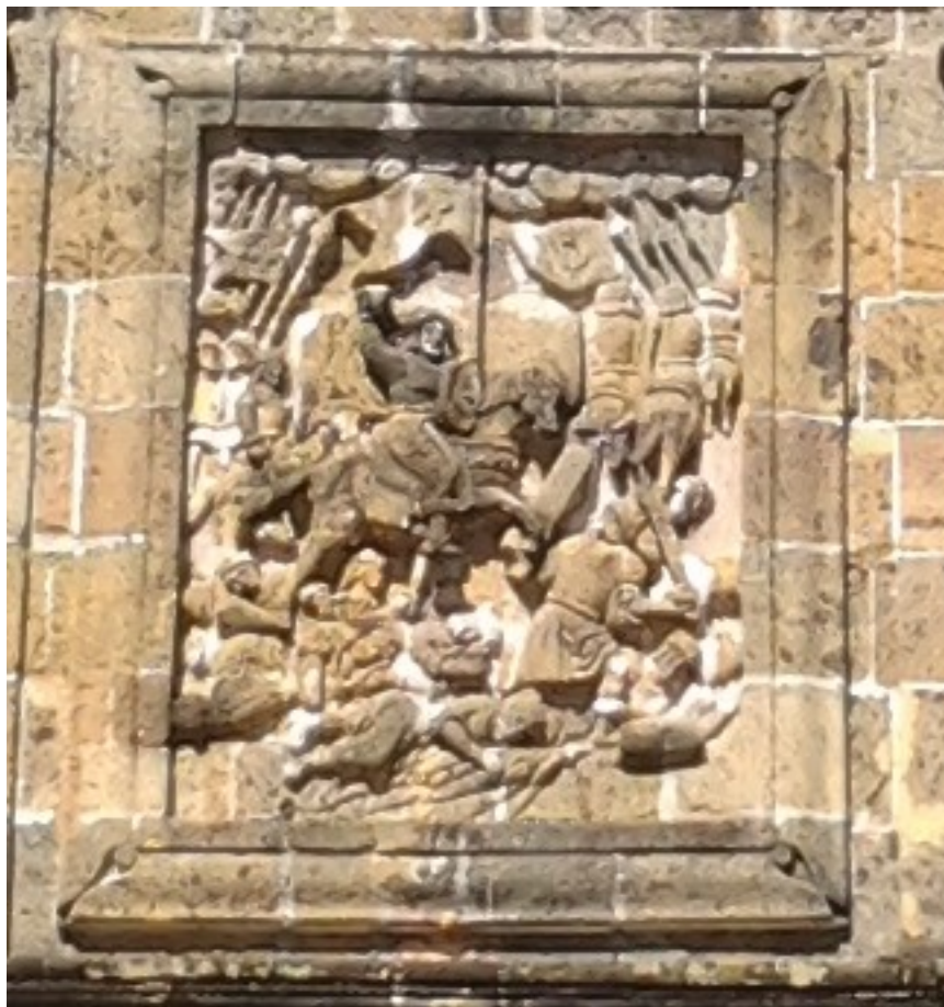
Figure 5: Detail of bas-relief of the apparition of St. James the Apostle against Moorish soldiers.