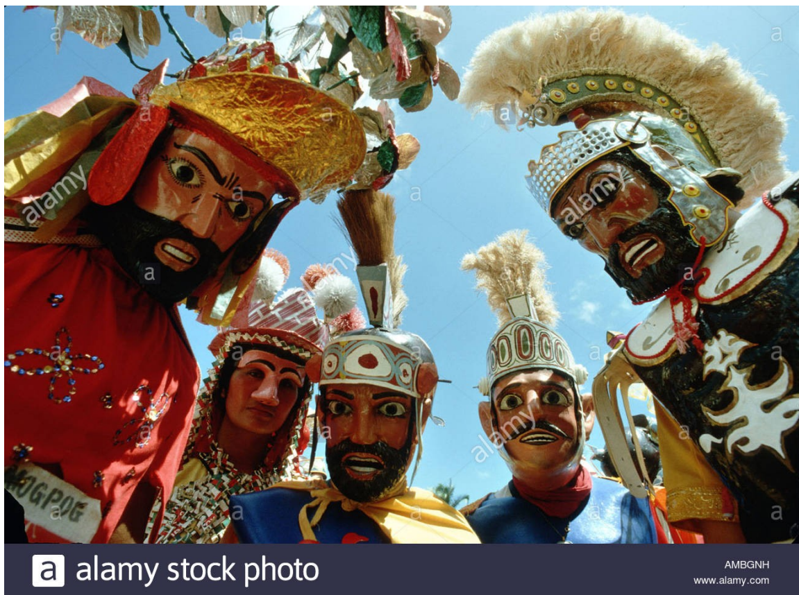
Figure 2: Moriones festival masks in Marinduque