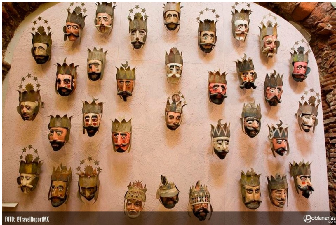
Figure 3: Puebla masks at the Rafael Coronil Museum in Zacatecas, Mexico (copyright pending)

Perhaps not coincidentally, the aforementioned town of Paete is known for not only paper-mâché masks and images, but also for possessing a long tradition of the Philippine martial art arnis (from the Spanish arnés , harness or military gear), which is practiced with long sticks akin to short wooden swords. This practice was common to both Spanish conquistadors, who engaged in friendly escaramuzas (skirmishes) with one another as a form of sport and training in swordsmanship; and many pre-colonial cultures of the South and Southeast Asian regions. Yet while many claim arnis to be a pre-