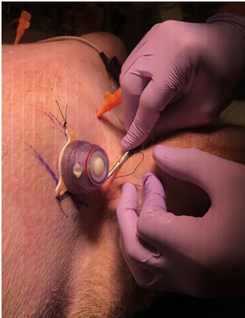
Figure 1 Securing PPTS port after insertion (prior to attachment connection). PPTS, PleuraPath™ Thoracostomy System.

the side with control device insertion, a traditional 36-Fr chest tube (Teleflex, USA) was used and secured in standard fashion (i.e., shoelace suture, occlusive gauze, gauze, tape). For the PPTS intervention side, a PPTS port with chest tube attachment (36 Fr) was placed and secured via the device's adhesive backing and suture-eyelets ( Figure 1 ). Both the traditional and PPTS chest tubes were then connected to individual dry-suction apparatuses (Ocean 2050, Atrium), with the suction off and tubes clamped to prevent drainage ( Figure 2 ).