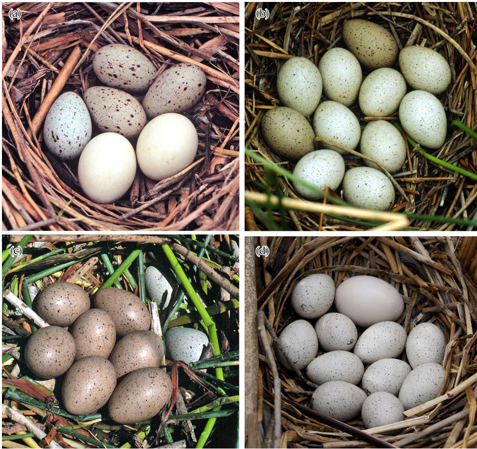
Figure 2. Natural and experimental brood-parasitic eggs. (a) Two real black-headed duck eggs (white) in a red-gartered coot nest in Argentina. (b) American coot nest with nine host eggs and two conspecific brood-parasitic eggs (darker eggs) in British Columbia. (c) American coot nest with seven host eggs and two paler conspecific brood-parasitic eggs in the process of being buried in the edge of the nest. (d) American coot nest with an experimental brown duck egg.

three treatments and compare overall rejection rates. This comparison serves the same function as the comparison of the white duck treatment but the much larger sample size increases the statistical power of the test.