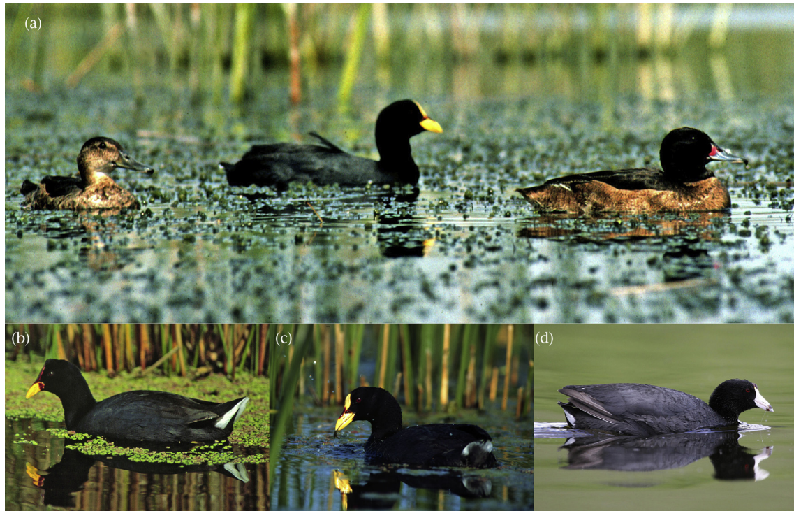
Figure 1. Brood parasites and hosts. (a) A pair of black-headed ducks, an obligate precocial brood parasite (female on left, male on right, and a main host, the red-gartered coot, in the centre). (b) Red-fronted coot, one of the two main hosts of the ducks in Argentina. (c) Red-gartered coot, the second main host of the duck. The two Argentine coots also show brood parasitism within species. (d) American coot, a species with conspecific brood parasitism but no interspecific brood parasitism.

Water levels were stable in these wetlands: an important detail, because rapid increases in water levels have been shown to affect egg rejection rates in both the South American species of coot (Lyon & Eadie, 2004; Weller, 1968) and in the American coot (Weller, 1971). Additional details about the study area are provided in Lyon (1993b).