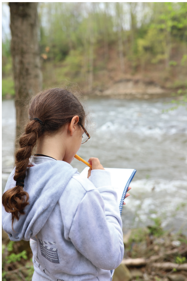
Student taking notes by the river during environmental education program.

Teachers identified hard-to-teach and difficult-to-learn concepts that would be best taught in a field setting. Students expressed an interest in learning about the local natural environment. At the time, there was a trend to teach about tropical