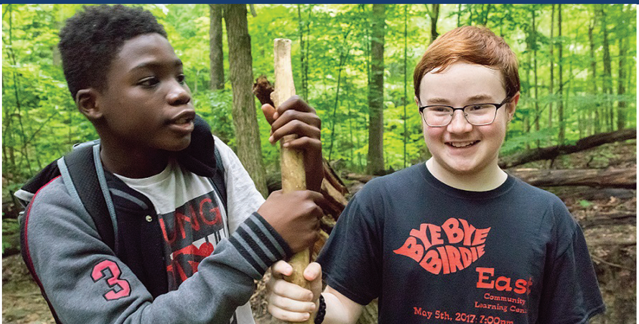
Boys hiking during program at the national park. | Zaina SalemPhoto ↓