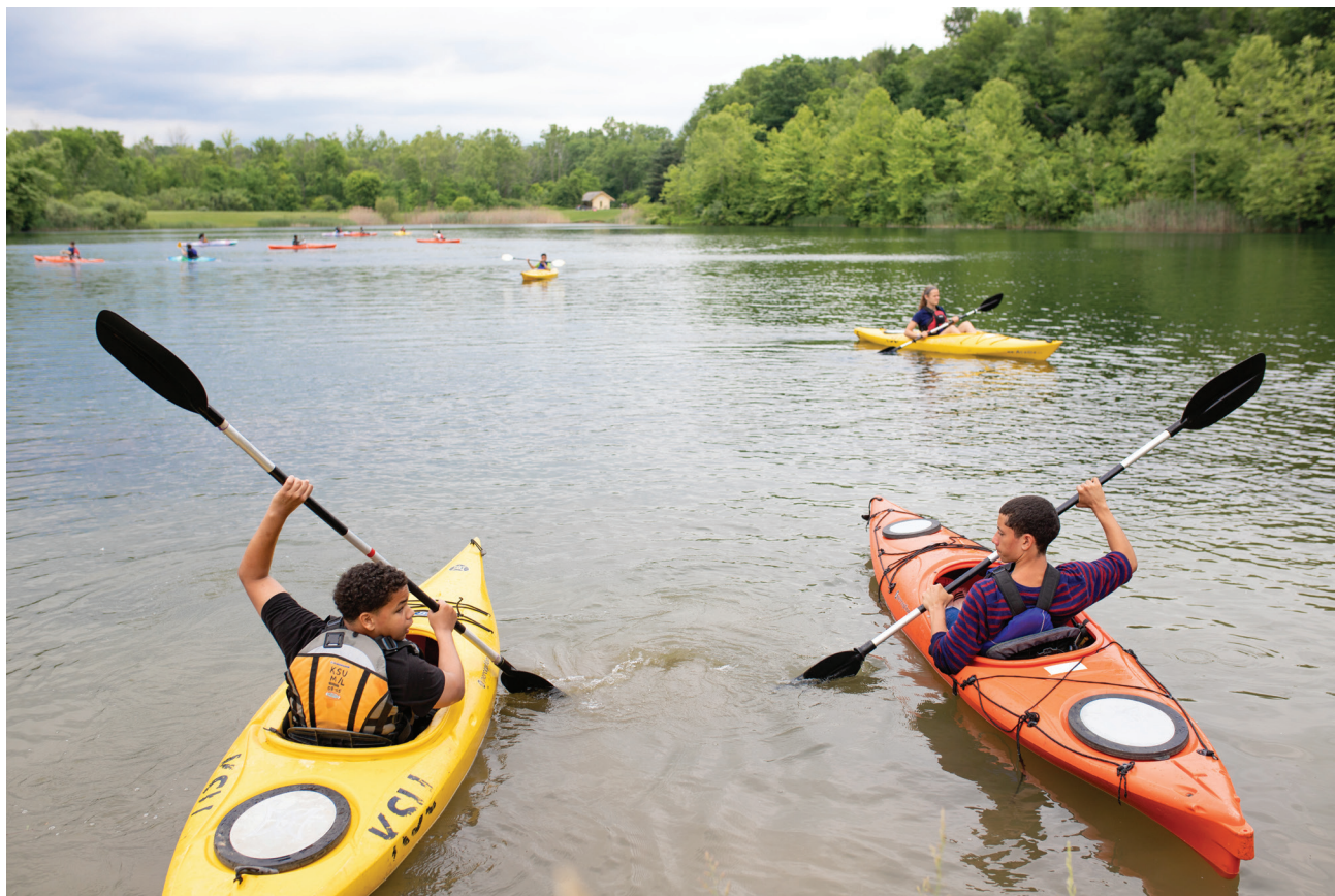
Students kayaking on the Cuyahoga River.

From the beginning, NPS and nonprofit staff agreed that engaging the community was critical to