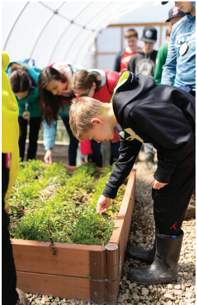
Students working in garden during environmental education program.

The staff of Cuyahoga Valley Environmental Education Center has embraced a mutual learning ap-