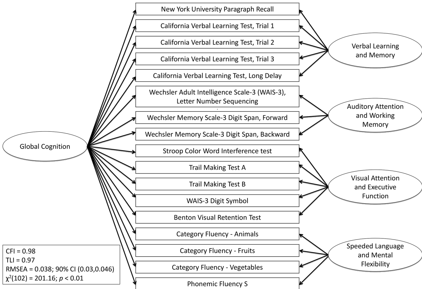
Fig 2. Bifactor model for the cognitive baseline data. CFI, comparative fit index; RMSEA, root mean square error of approximation; TLI, Tucker-Lewis index.