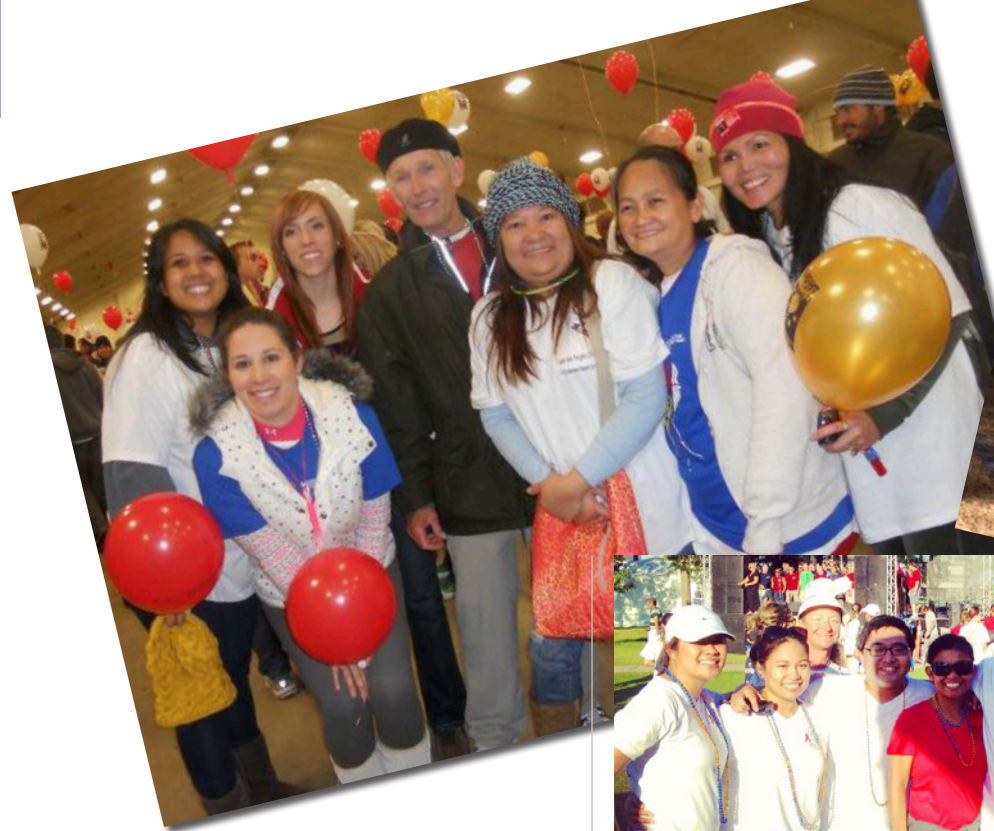
3West staff at the Light the Night Walk to benefit the Leukemia and Lymphoma Society