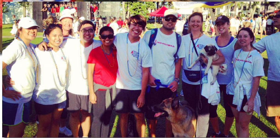
TOP: 6East staff at the AIDS Walk