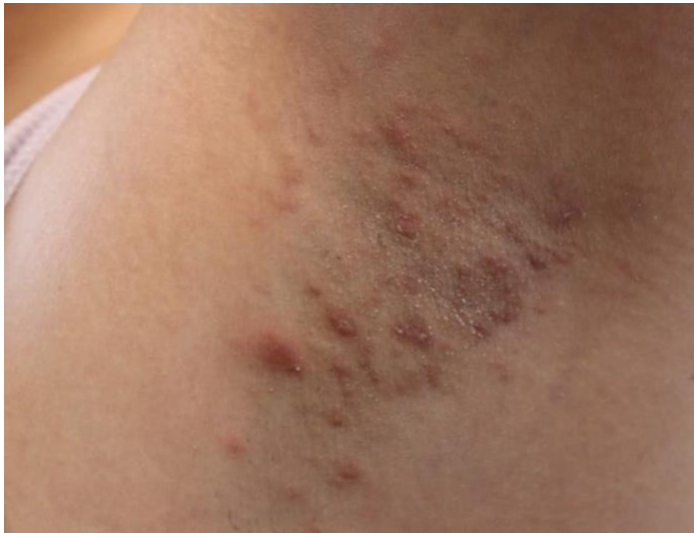
Figure 2. Additional inflammatory papules of left axilla.