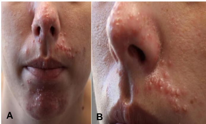
Figure 1. A) Numerous erythematous to yellow-brown papules noted involving the central face. B) Closer view of A.

develop new lesions and was ultimately lost to follow-up.