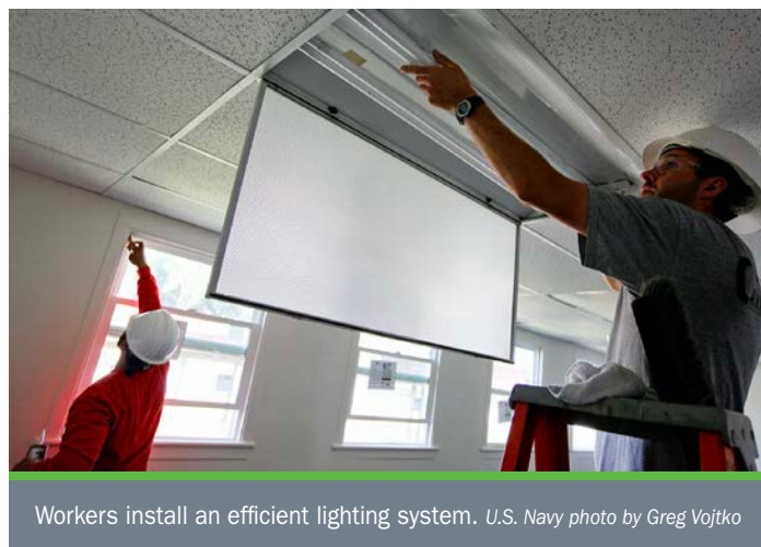
Workers install an efficient lighting system.