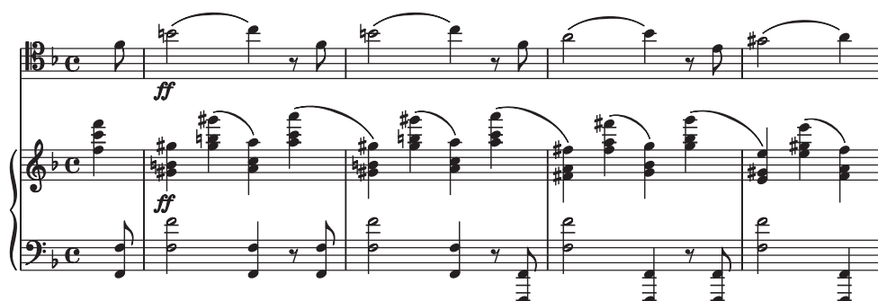
Ex. 7 Brahms, Op. 38, first movement: bars 114–117

Contrary to the peaceful main theme, he argues, this theme attains a ‘demonic colour, through a certain inner conflict’, yet then ‘dissolves into more melodic passages’, finally leading to what Bagge describes as ‘rumbling, imitative material’. 110 This theme is the ‘focus of our attention for 20 bars, then one follows the more melodic portion in B major [bar 79], that leads to the reprise in 12 bars’ (perhaps, Bagge claims, for the sake of a melodic contrast to the previous B minor section) (Ex. 6d). 111