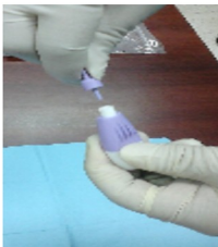
Paso 7. Gire la tapa de lanceta y jale y bote tapa. Ponga la lanceta en el costado de la yema del dedo y empuje hacia el dedo hasta oír clic. Luego bote la lanceta en bolsa roja.