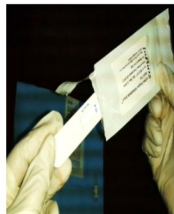
Paso 4. Abra el dispositivo y colóquelo sobre el campo.