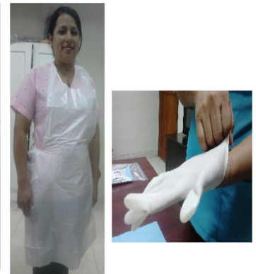
Paso 3. Póngase el mandil y los 2 guantes.