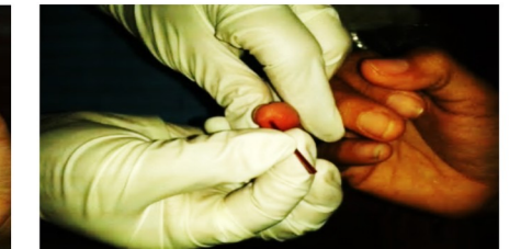
Paso 9. Coloque el tubo capilar en la gota de sangre hasta llenarlo. Vuelva a masajear de abajo hacia arriba si necesita más sangre. Presione dedo picado con 1-2 gasas.