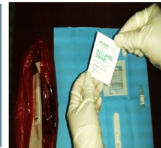
Paso 5. Abra las 3 gasas y dóblelas en 4. Después abra los 2 sobres de alcohol.