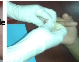
Paso 6. Ubique el dedo a picar (preferible dedo donde va el aro de matrimonio). Límpielo usando los 2 alcoholes.