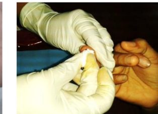
Paso 8. Limpie la primera gota de sangre con gasa. Masajear dedo de abajo hacia arriba para obtener otra gota.