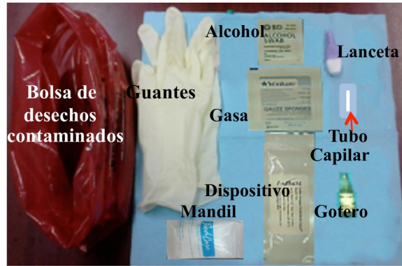
Paso 2. Coloque los materiales como en la foto y reconozca cada uno. Use la bolsa roja para todo lo que vaya botando.