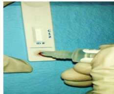
Paso 11. Poner 2 gotas del gotero en el mismo círculo.