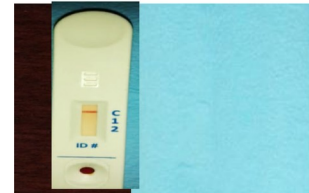
Paso 12. Ponga el dispositivo a un lado del campo. Elimine todos los demás materiales en la bolsa roja y asegúrela (amarre). Después de 30 minutos, observe el resultado en el dispositivo.