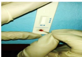
Paso 10. Poner toda la sangre del capilar en el círculo de abajo dando golpecitos con el capilar en el fondo del círculo.