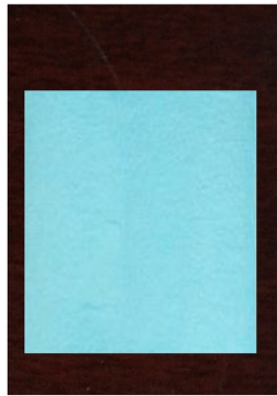
Paso 1. Coloque el campo celeste sobre la mesa.