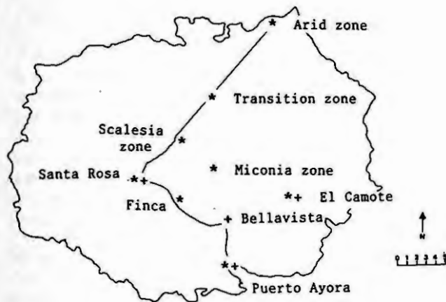
Figure 1. Santa Cruz island, showing the cross-island road and sampling areas: * line transect only, ** house survey and line transect, + house survey only.

Nine sites were chosen across Santa Cruz representing various aspects of the island in terms of vegetation, agricultural and urban characteristics (see Figure 1). Most sites were situated along the cross-island road, not only for ease of access but also as the road was considered the most likely means of dispersal of brown rats in association with the activities of man.