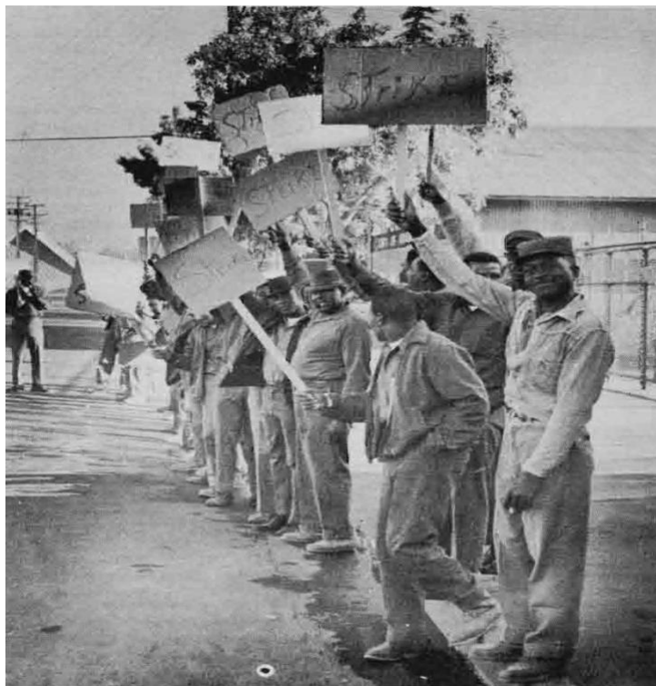
Figure 1: Sanitation workers form a row of workers outside the city's corporation yard. The strike lasted three days and made national headlines on October 25, 1966. 41