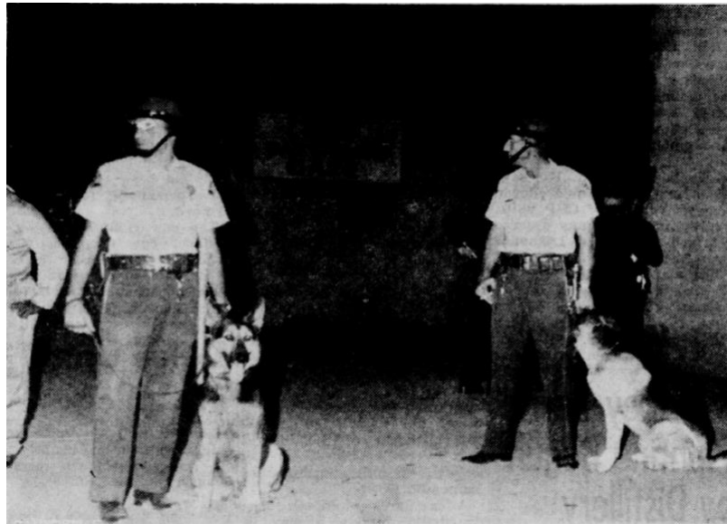
Figure 5: Deputies with police dogs on Lakeview Ave after youth rebellion sparks arrests 61