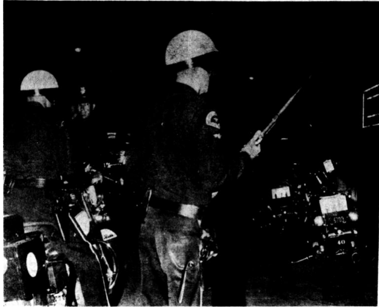
Figure 4: Officers Patrolling Lakeview Ave after youth rebellion sparks arrests 60

particular youth, remained high as law enforcement officers continued to exert racial violence against residents in the community. 59