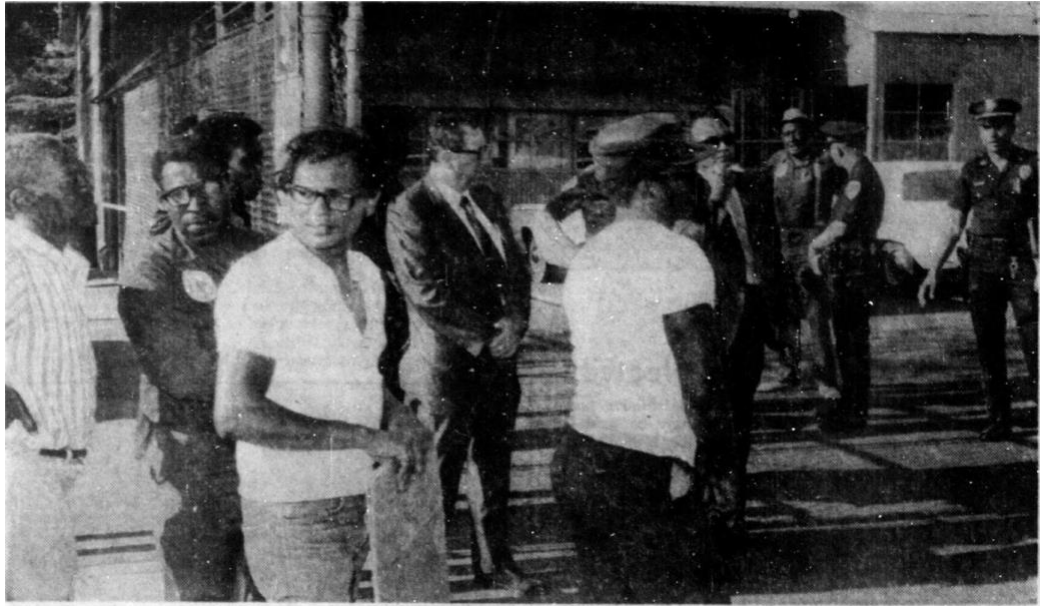
Figure 2: On July 27, 1972, over 45 Black and Mexican sanitation workers strike outside of the city's corporation yard surrounded by city officials and law enforcement. 45

migrant workers. Perhaps conflict did occur, but not to the extent that it broke union efforts. On July 26 th 1972, dozens of Black and Mexican sanitation workers engaged in a three day strike over what they viewed to be racially discriminatory and abusive working conditions. On the day of the strike, city officials initiated law enforcement to break up the strike. Law enforcement prevented the strikers from interacting with the garbage trucks as they rolled out of the yard. However, rather than have workers continue the strike, the city and the union came to a verbal agreement to which the workers would exempt from termination. 44 Although much of the grievances were never solved, the strikes showcased the collective power of Black and Brown organizing, a power that in many ways transcended the racial and cultural boundaries which existed between them. Within a period of ten years, Black and Mexican sanitation workers in Bakersfield successfully organized for the proposals they sought out to implement. Work stoppages were a prevalent way of showcasing their collective power in a context where individually workers had no power. But, also loud talking and shouting and foot dragging by the front of the yard were strategies of indirect organizing that management could not practically police.