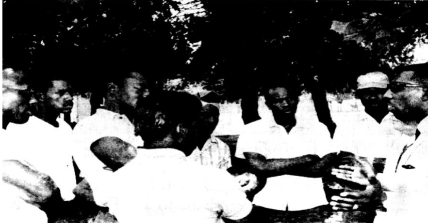
Figure 6: Black youth at California Park venting their frustrations after two days of rebellion against police and economic hardship. 65